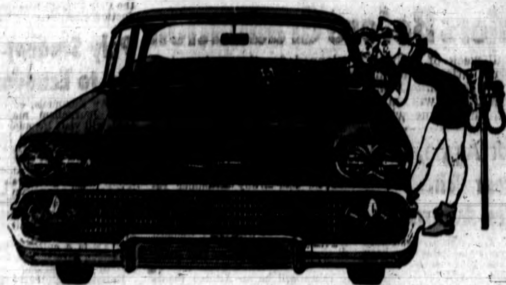
The beautiful Delray 2-Door Sedan, one of three budget-priced Delray models.

Air Conditioning—temperatures made to order. Get a demonstration!