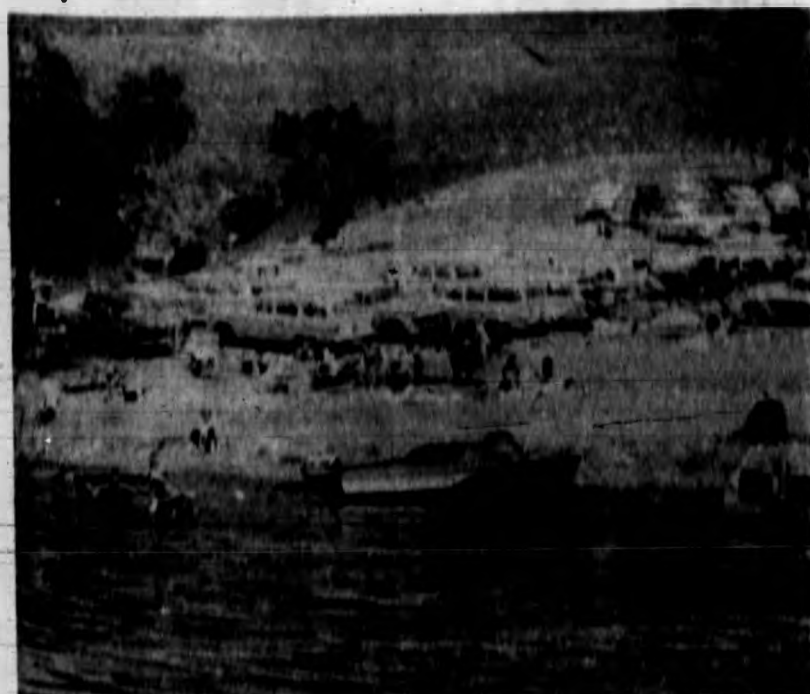
PICTURED HERE is the site of the "Poly Picnic" slated for next Sunday at Nacimiento Dam. The outing, sponsored by the College Union Outings Committee, will offer such recreation as swimming, boating, archery, volleyball, skindiving, and softball.