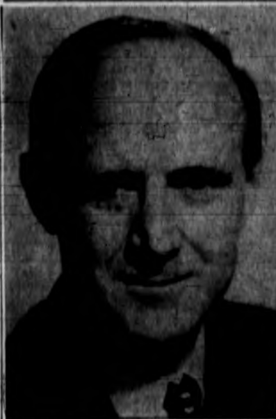
William H. Pickering

Born in Wellington, New Zealand. —See Satellite, page 2