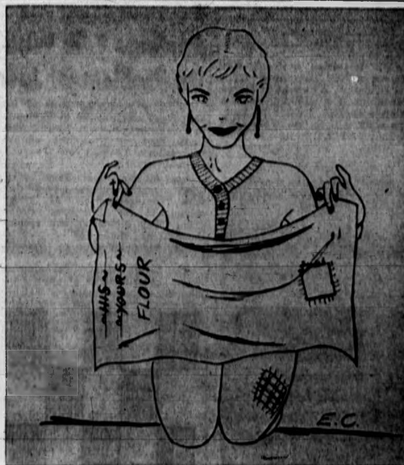
"IS THIS TOO MODERN?"

This could give rise to the newest racial group idea on campus—a fraserity—allows both men and women to join. It probably wouldn't even be allowed a trial basis toward recognition. That is To Say The Least.