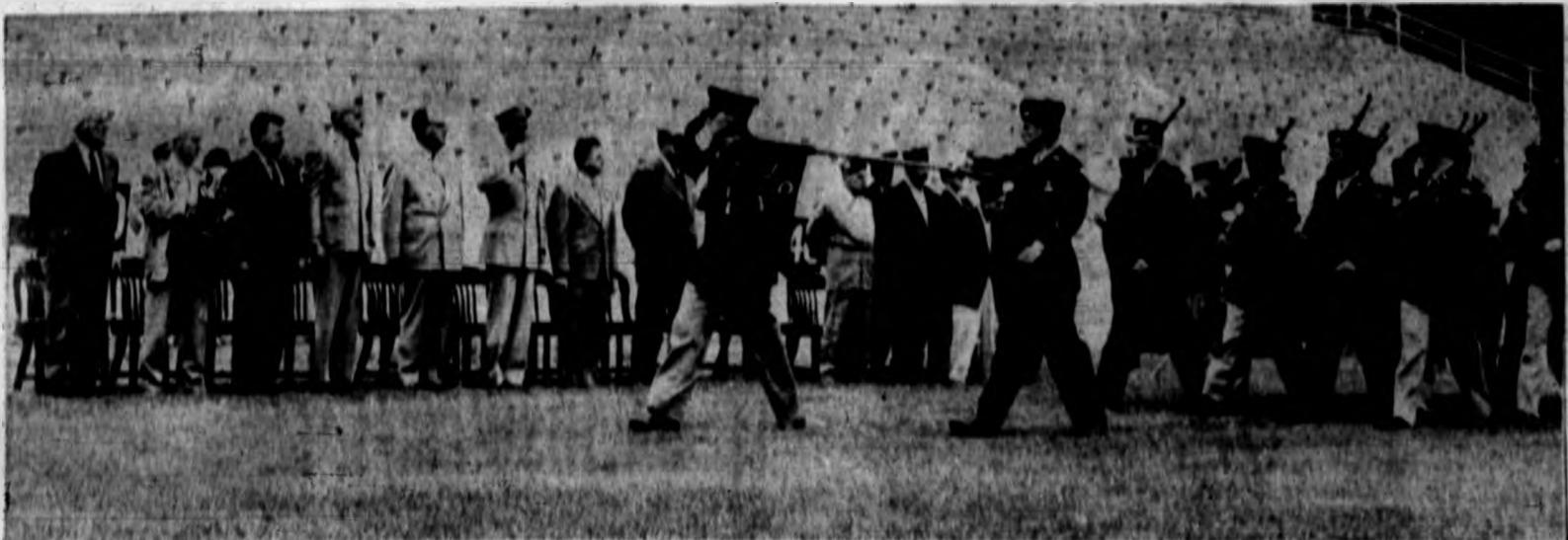
EYES RIGHT!—Charlie company gives a snappy "marching salute" as they pass the reviewing stand at the annual President's inspection this week. Following the review of the troops, awards were presented