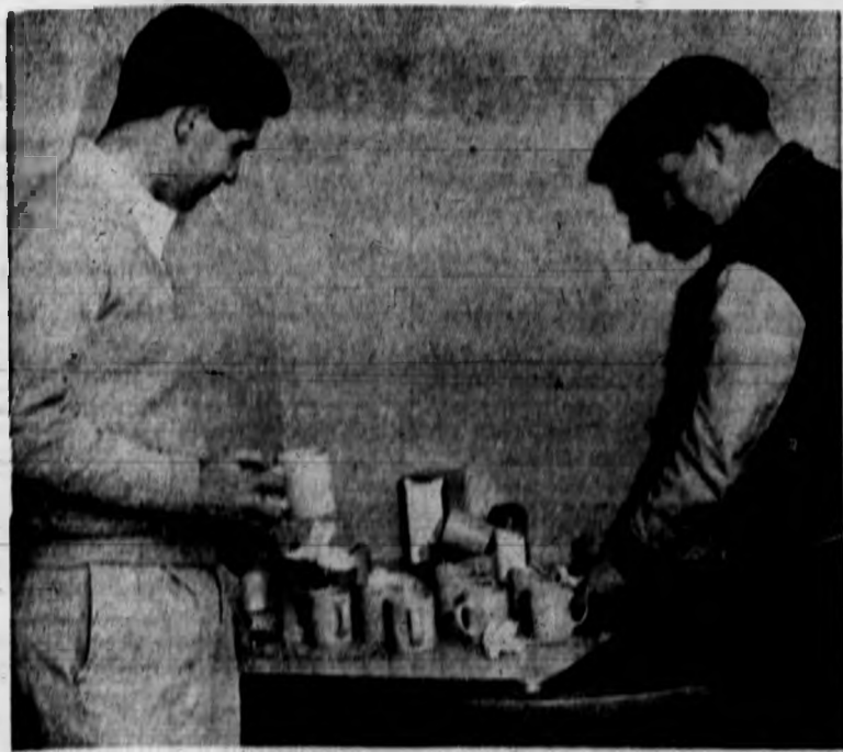
COULD THIS BE YOU? —Why is it that ALWAYS after a coffee break the tables in El Corral look like this? This sloppy situation has rapidly gone from bad to worse. Whose fault is it—yours—the students. And not only the students either, employees and faculty are also responsible. In the next issue of El Mustang will be printed more pictures and stories explaining how you can help alleviate this unsightly, germ-spreading mess.