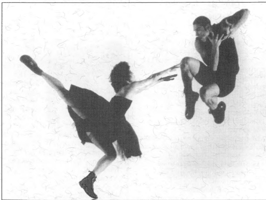
Members of ODC/San Francisco dance troupe