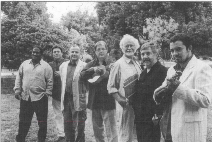
Chilean ensemble Inti-Illimani will play at the Christopher Cohan Center's Harman Hall at 8 p.m. Oct. 26 as part of Cal Poly Arts 2001-2002 season. With flutes, guitars, congas and more than two dozen other indigenous wind, string and percussion instruments, the group produces the sounds of the Andean regions of South America.

Music : Frederica von Stade (rescheduled from last season), Christopher Cohan Center's Harman Hall, 7 p.m. ($)