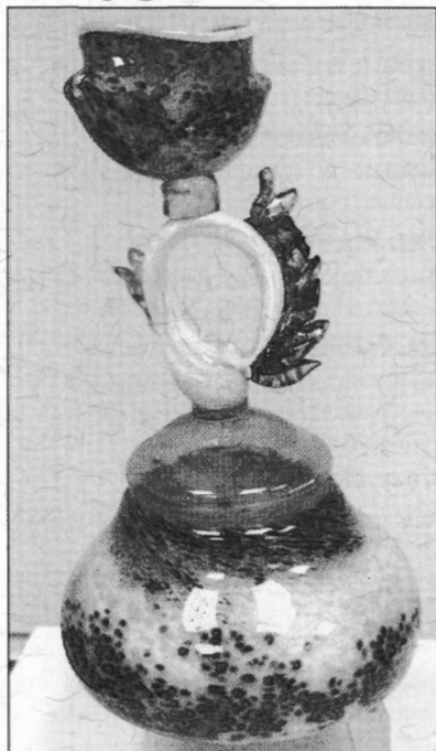
'Ring of Fire #8,' Art and Design Professor George Jercich's blown glass 18" x 9" x 9" two-part vessel, will be included in the upcoming exhibit in the University Art Gallery. (See story on page 8.)