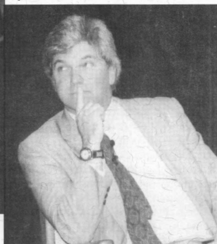
Peter King, syndicated columnist at the Los Angeles Times.

There were no easy answers at the recent "The Good, the Bad and Election 2000" media forum, which drew approximately 450 people to the Performing Arts Center to hear seven analysts discuss the most-unusual circumstances of the Nov. 7 presidential election.