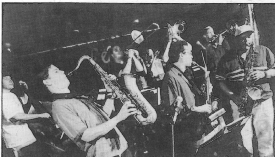
Come Blow Your Horn . . . Cal Poly Arts presents the Mingus Big Band Oct. 4.

For more information, call the Physics Department at ext. 6-2448. □