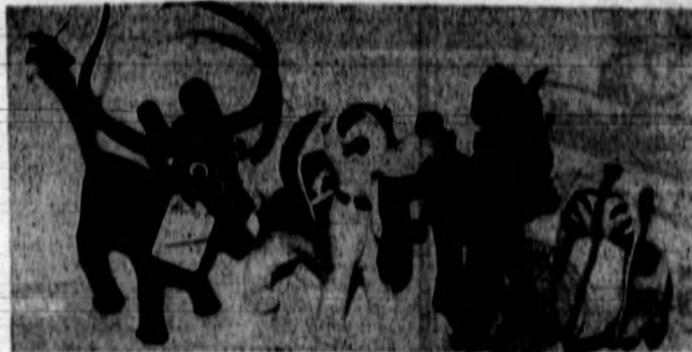
Cheerful Charlie-Optometrist-Celt Jr.-Cheerup Charlie.

El Corral COLLEGE STORE BASEMENT ADMINISTRATION BUILDING