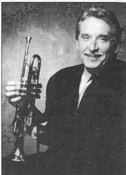
Doc Severinsen, former music director for Johnny Carson's "Tonight Show," will perform with his big band in Harman Hall Jan. 22. See story, page 5.