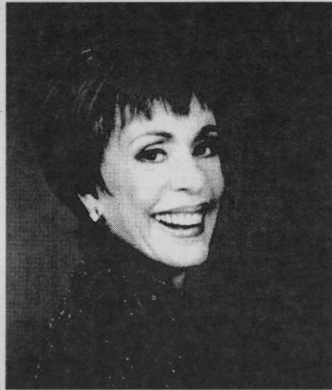
Carol Burnett — Tickets are on sale for Burnett's Nov. 1 appearance in Harman Hall. See the Aug. 29 Cal Poly Report.

Yes, you're looking at a new format for the Cal Poly Report — one of a number of changes we plan to make during the fall.