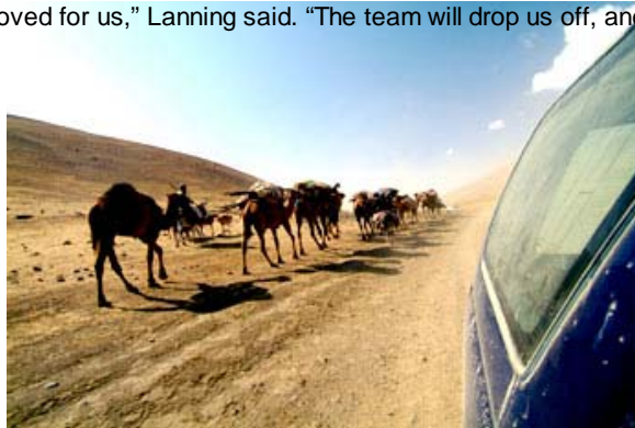
Lanning's group passes a camel train heading for the lowlands in Badakhshan, northern Afghanistan.

Requires Flash player. Download Flash player free