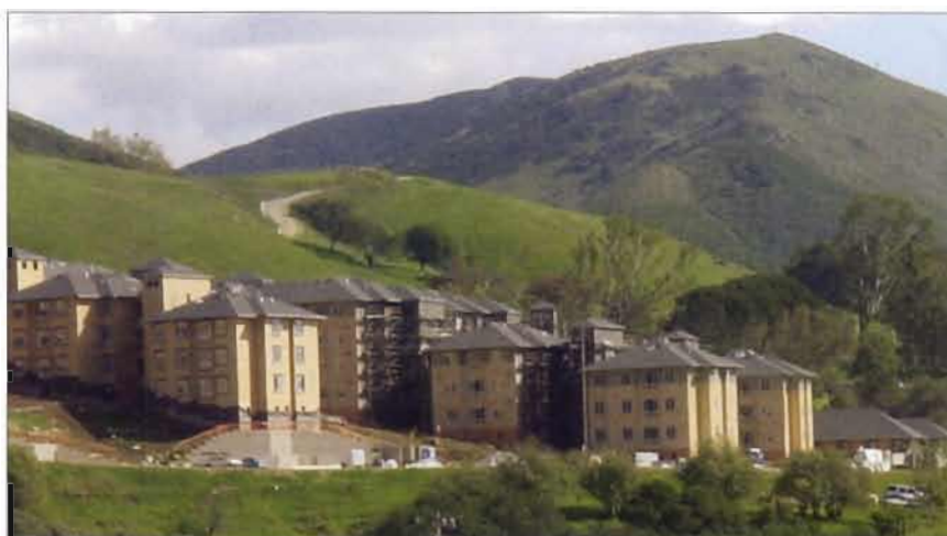
Cerro Vista student housing complex