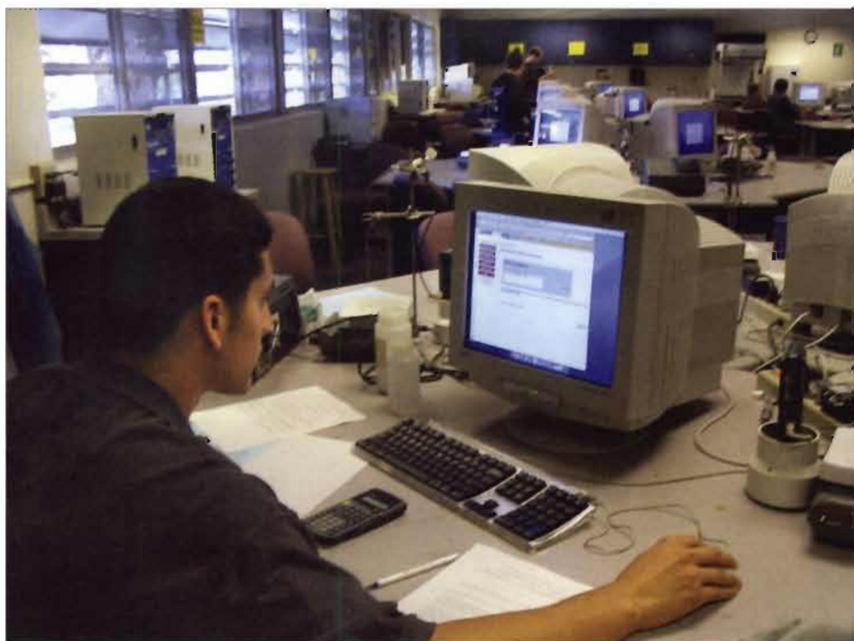
Students take exam in Blackboard.

"Learning Blackboard has been a very important experience for me," she says. "It provided me with the opportunity to create a site where the students could be exposed to the Italian language through authentic material and where they could review material used in class. I found it really useful for keeping track of my students' work and progress and for providing immediate feedback to them. Comparing the results of this year's final exam with those of last year, I found considerable improvement overall."