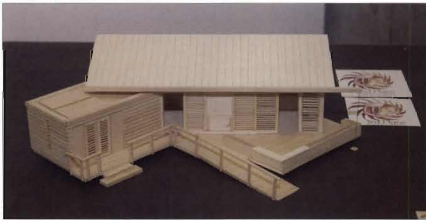
Student model of proposed Solar Decathlon home

"We would like the project to be used as a kind of prototype to address particular housing problems in California," Peña says. "It could be used as a model for migrant farm-worker housing or as a more environmentally friendly alternative to mobile housing."