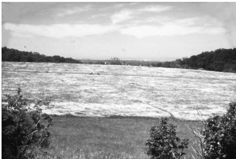
Figure 2. A sharply-demarcated floristic boundary under the control of an edaphic boundary at Jasper Ridge Biological Preserve, San Mateo County, California. The yellow-flowered Lasthenia californica (Asteraceae; in background) is restricted to serpentine soils. The boundary between L. californica and grasses is defined by a serpentine-sandstone transition. Credit: Bruce A. Bohm.

in eastern North America originated in the formation of the ocean floor. Mantle rocks are produced along ocean ridges where partial melting in the upper mantle produces reservoirs of gabbro melt, or magma, that feed basalt lava flows from ocean ridges. As fresh melt is added, lava spreads from the ridges where it cools to form rocks (Wyllie 1979b). The succession of rocks produced from this melting and cooling, from bottom to top, is peridotite (modified mantle), gabbro, and basalt—a sequence called ophiolite. Most ophiolite is subducted, sinking back into the mantle, but some is incorporated into continental crust (Coleman and Jove 1992; Wyllie 1979b).