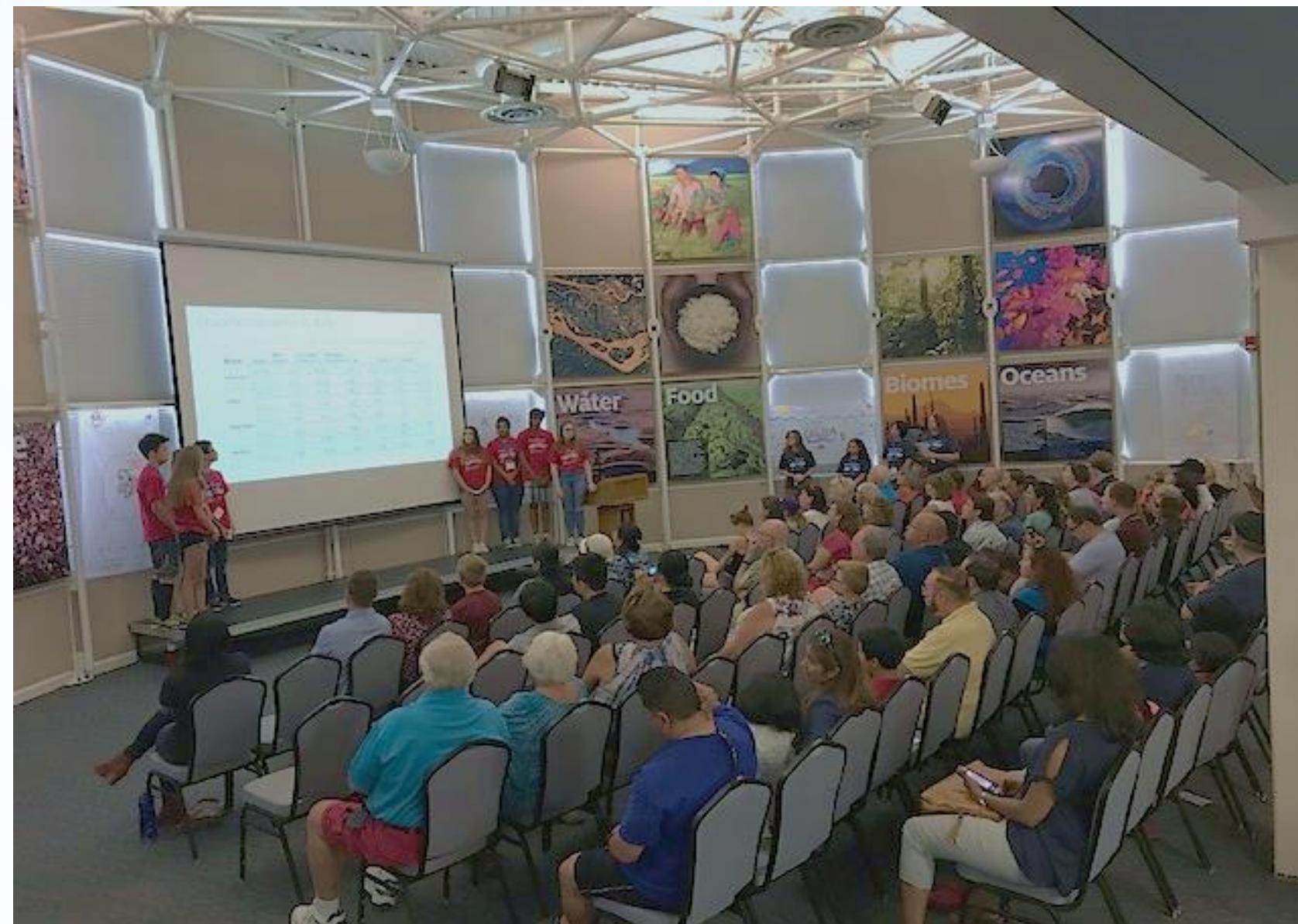
Summer Science Academy participants (left) present their research results to their families.