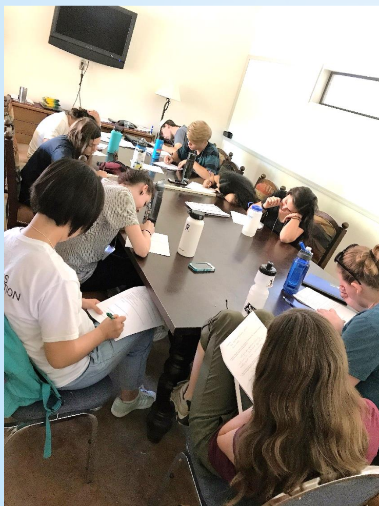
Outreach Scholars (left) and Summer Science Academy high school students (right) completing their surveys.