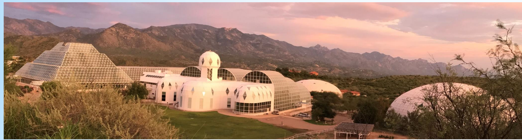
Photo of the Biosphere 2 campus at sunset.

Objective- This study comprises a program evaluation of the efficacy of Biosphere 2's education and outreach programs. The two related programs evaluated are the Summer Science Academy (SSA) programs for middle school and high school students and the Outreach Scholars (OS) program for college-level participants.