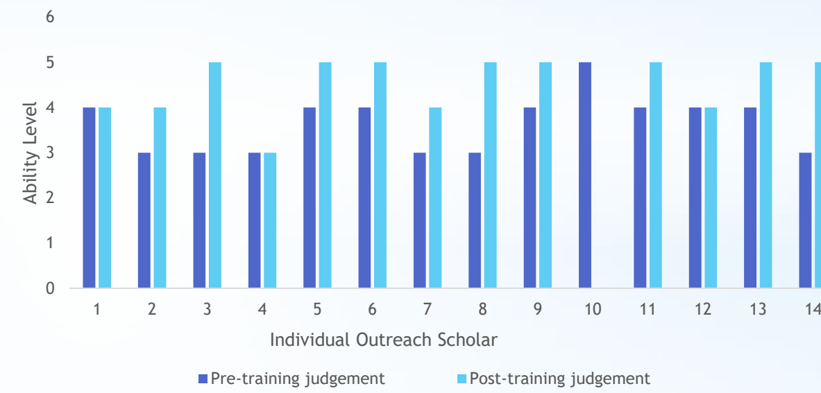
Fig. 2: Outreach Scholars' perceived ability to mentor SSA students after their training.

Although not a significant change, 29% of the middle school group ranked all steps correctly at the beginning of the program, compared to 41% at the end of the program. 28% of the high school group ranked all steps correctly at the beginning of the program, compared to 31% at the end of the program.