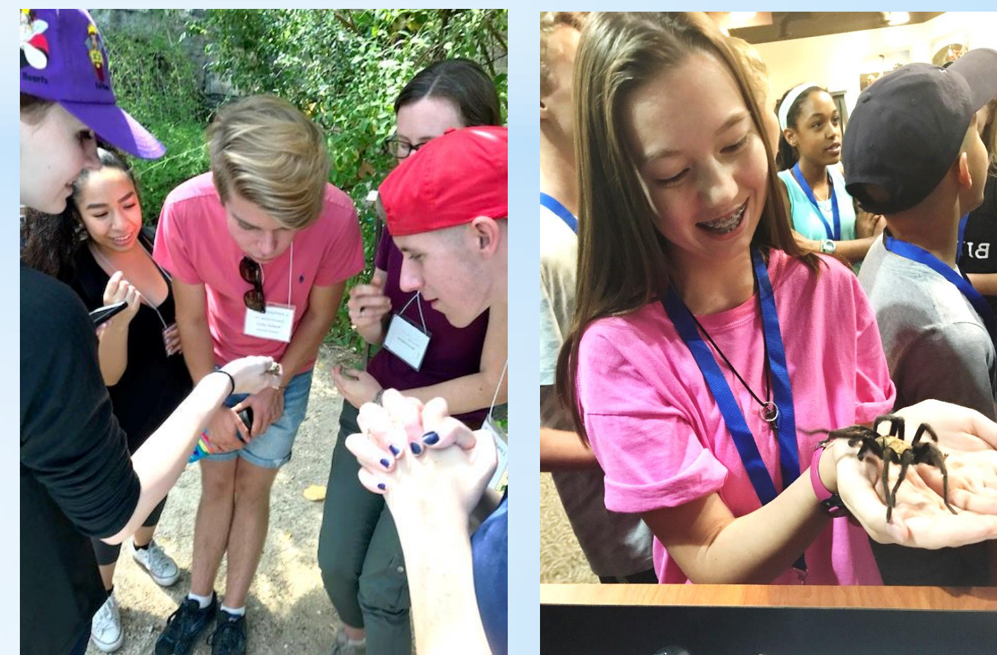
Outreach Scholars (left) and a Summer Science Academy participant (right) admire some of the inhabitants of the Biosphere 2 campus.