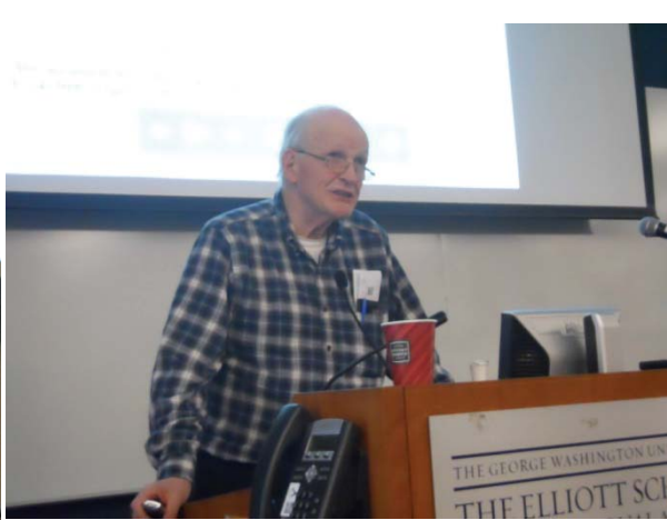
Left to right: Paul Richards (CTBT Seismology) and Frank von Hippel (Fissile Material Cut-off Monitoring)