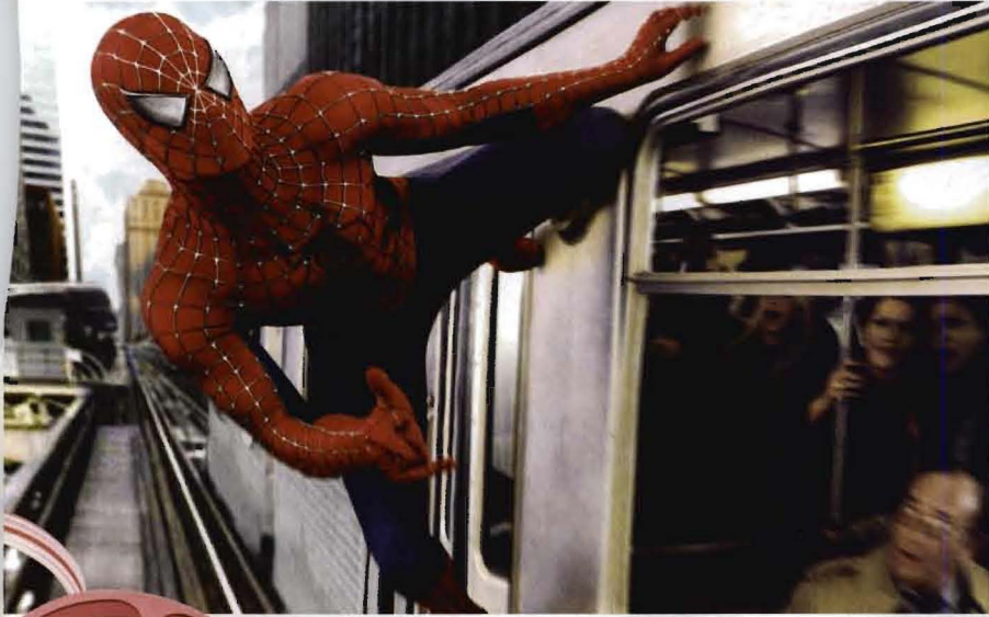
Tobey Maguire stars in Columbia Pictures' 'Spider-Man 2'