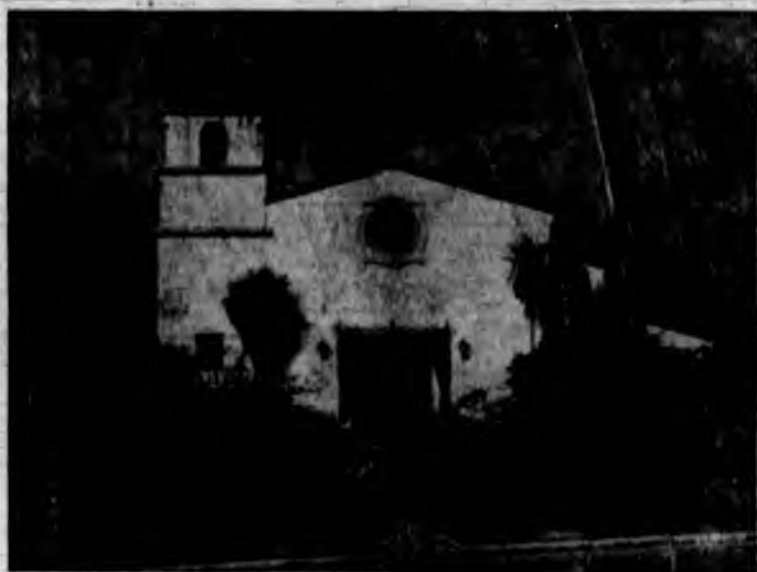
VOORHIS CHAPEL... inspiration for the song, "Chapel in the Moonlight." Cal Poly's branch school non-sectarian church is the focal point of activities on the San Dimas campus.

Following the opening assembly, visitors will be given an opportunity to visit a number of the open house exhibits before noon.