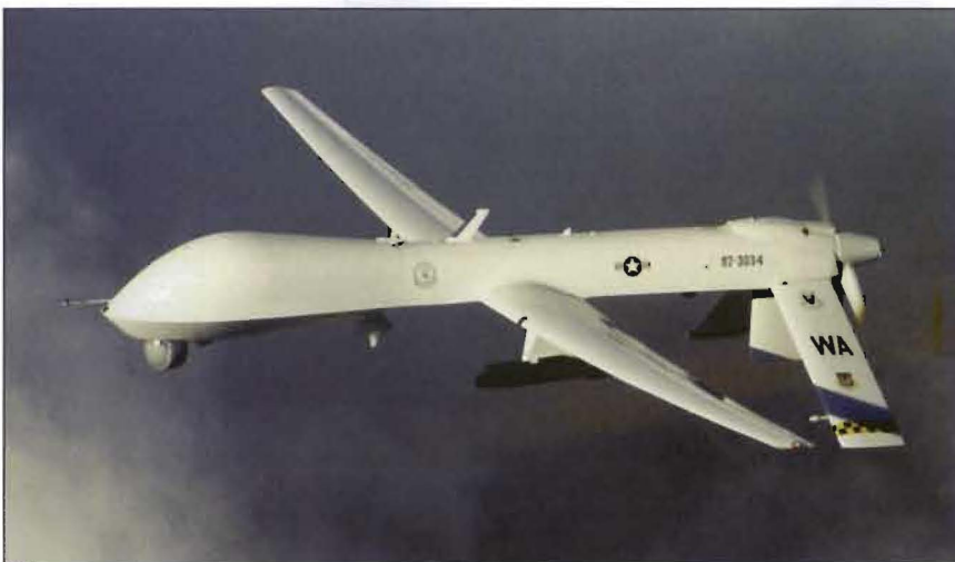
The Predator aircraft

General Atomics, which hosted the event, designs and produces unmanned aircraft systems, including the successful Predator, currently providing tactical and strategic intelligence to operational commanders worldwide. Among the company's newest projects are the larger Predator B and the high-altitude Altair aircraft.