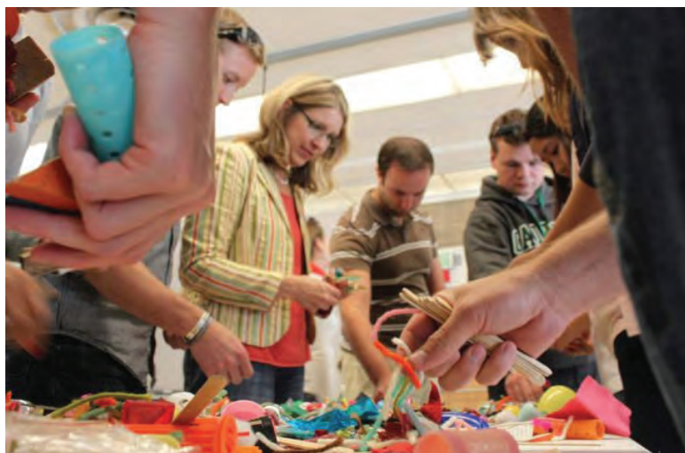
Figure 6: Education - M-Group members get involved in several school projects.

Policy planning efforts have resulted in high quality efforts for cities such as Belvedere, Daly City, Mill Valley, Sausalito, Sonoma,