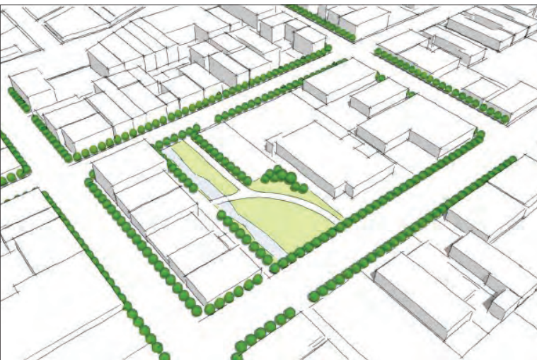
Figure 4: Policy planning - Burlingame Downtown Specific Plan.