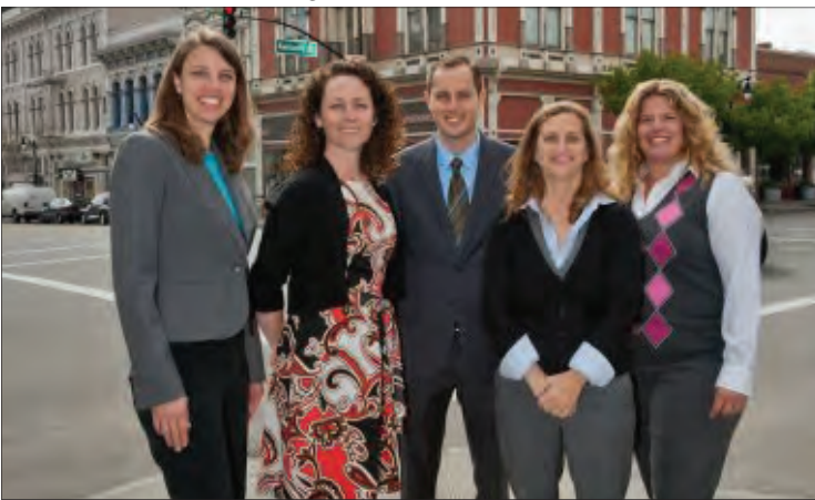
Figure 3: The Petaluma staff.

M-Group led a multi-disciplinary consultant team in preparing a new specific plan for historic Downtown Burlingame (Figure