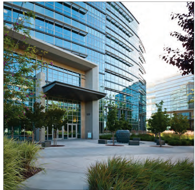
Figure 2: Sustainability services - Moffett Towers, Sunnyvale CA.

4). Downtown Burlingame is an undeniable success, but like all downtowns it is subject to ever-changing lifestyles and consumer preferences. The plan called for a highly involved program for civic engagement informed by thoughtful analysis and evaluation, allowing the community to develop a vision and ultimately a plan that is realistic and compelling for the future while being "uniquely Burlingame."