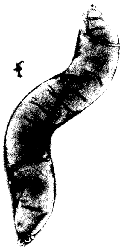
Figure 2. Negative stain of magnetic spirillum strain 1. This bacterium was magnified 50,000 times with a transmission electron microscope. Bar = 1 micrometer

presence of intracellular magnetite implies a process of bacterial synthesis.