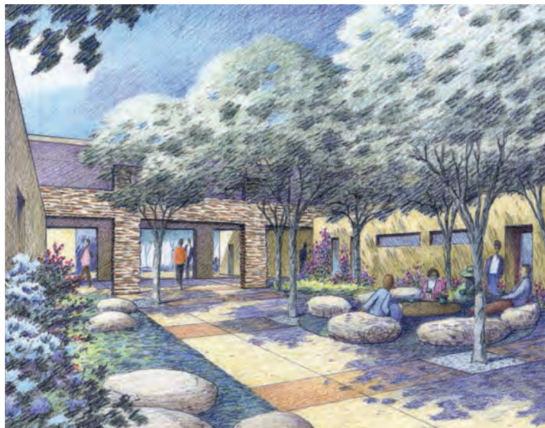
Figure 13: Abby's Rock Tea Garden.