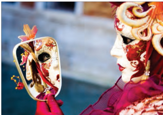
Figure 6: Venetian Carnival, Italy.