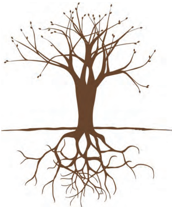
Figure 8: Xsense's Tree.