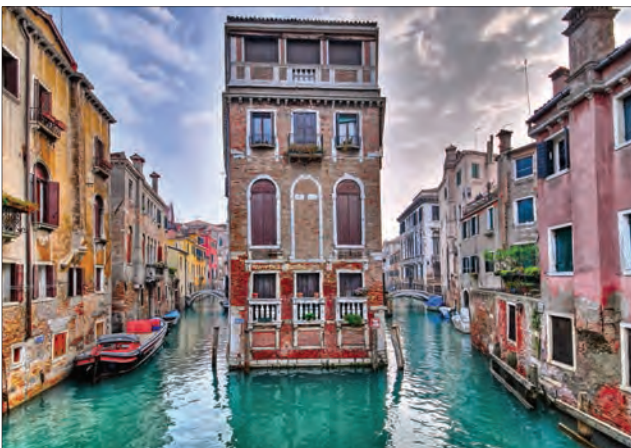
Figure 4: Venice, Italy.