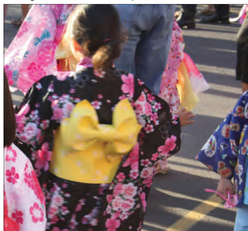
Figure 2: Obon Festival, Japan.