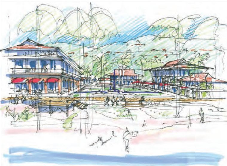
Figure 20: Rain Dance Square.

experience that valued local tradition and added an element of ingenuity and wonder to connect a constraint to the local love for rain, coffee, Pura Vida, and sustainability (Figures 30, 31, 32). These insights also led the architects to design the plaza and buildings according to a new gestalt that said, "We own the rain."