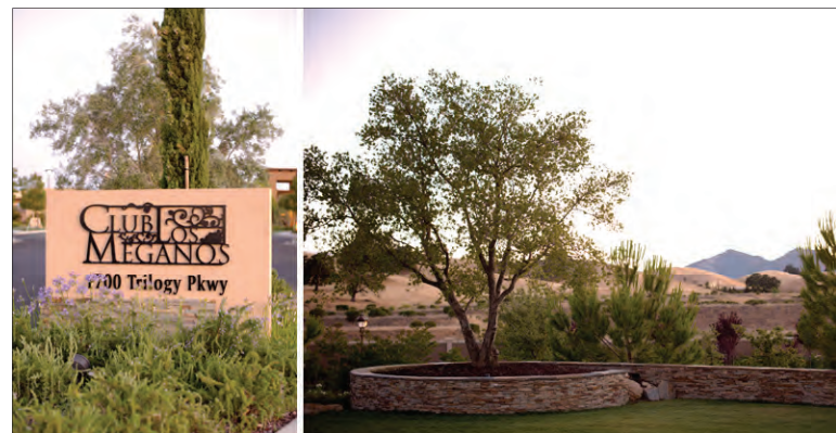
Figure 14: Club Los Meganos, Trilogy.