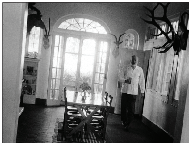
Figure 3: Hemingway Room Havana, Cuba.