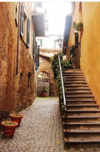
Figure 1: Tuscan Village.

The takeaway point here is that places are not just architecture and design, but sensorial experiences. The more senses involved, the more memorable the event, the more connected the senses, and the stronger the memory. A developer should