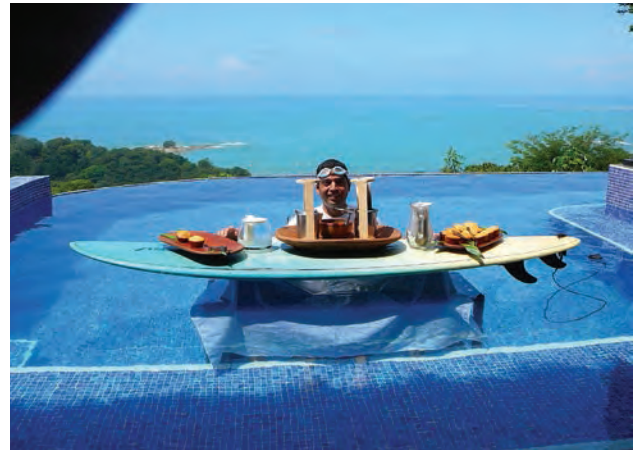
Figure 32: Pura Vida coffee break during the design charrette in Dominical.

Want to create a story? Don't just build one. Build on one. You think there's nothing there? There always is.