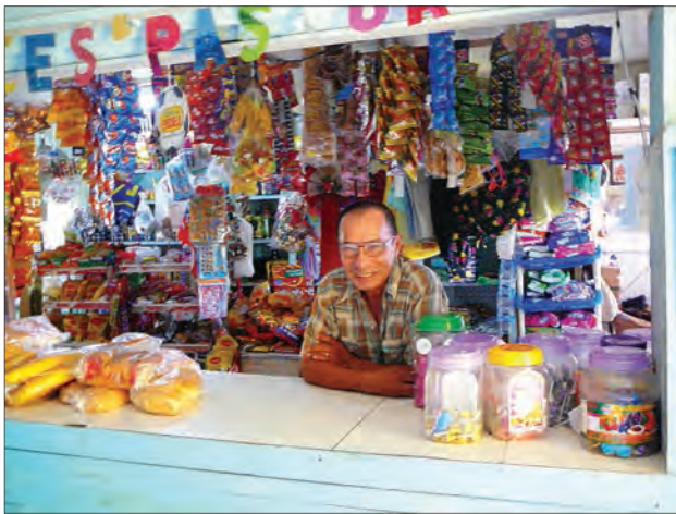
Figure 18: Pulperia in Palmar Sur, Costa Rica.