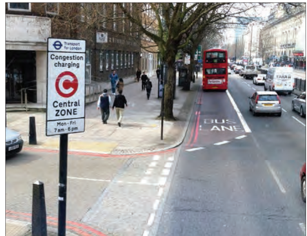
Figure 1: The congestion charge boundary on Euston Road, where two of six lanes are dedicated for bus priority.

A similar calculation may be done for the change from 2002 to 2009, but in this case people were clearly switching to bicycles