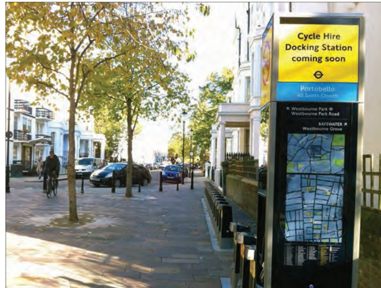
Figure 4: In Notting Hill, a street was closed to divert traffic and create a pedestrian plaza with a bikeshare station. The sign is an example of the Legible London wayfinding system.

Finally, London's willingness to experiment has helped it remain nimble and responsive to rapidly changing conditions as volumes of bicyclists and pedestrians increase. Installing