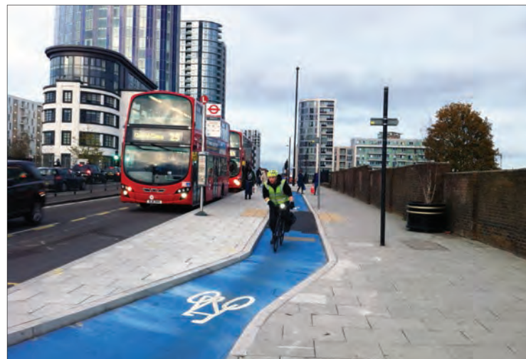
Figure 3: Near Stratford, the newest generation of bicycle superhighways segregate bicycle and bus traffic.

An important caveat to keep in mind, when thinking about whether these sort of effects could be achieved by similar policy interventions in other cities, is that London is an ancient city with good bones to build on. Its core, inside the charged area, still has pedestrian-scale streets laid out by the Romans 2,000 years ago and during medieval times. During the Victorian era, a dense railway network was developed, including fifteen rail stations and the first ten lines of the Underground system. These stations and right of ways have been in near-constant use, or redeveloped to meet changing needs, over the past 150 years. London's highly transit accessible center helped it develop into a monocentric city where employment is concentrated in the central business district. So we are at a disadvantage in a lot