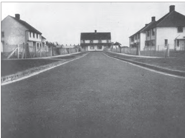
Figure 5: The kind of informal photograph printed in the pages of AR special issue "Outrage" (1955, p.383) and mentioned by Gold & Gold and others.

The impact of Outrage , described by Hugh Casson as a "hard blow to the self-esteem of architects and planners" 9 , prepared the ground for the launch, in December 1956, of another memorable special edition: Counter-Attack against Subtopia edited by Ian Nairn. In this issue the critique on the suburbs, the New Towns and the legacy of the garden city is further developed and explored in more depth.