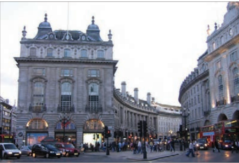
Figure 3: Regent's Street from Picadilly Circus: the picturesque London praised by the Townscape movement.

director of architecture in 1948, and he soon began to put into practice some of Hastings's ideas. 3 The Festival in fact can be considered the epitome of an urban landscape felt and created with Picturesque sensitivity and Casson, loyal supporter of Townscape, described his vision for the South Bank, the Festival venue, explaining that buildings had been clustered around a series of courtyards, each with different colors, shapes and silhouettes, so that the visitor when passing from one to another was exposed to a series of constantly changing views and the total size of the site would be camouflaged by the variety of each separate part. 4