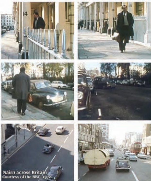
Figure 7: Scenes from the TV series “Nairn Across Britain”, episode “From London to Milton Keynes”, as shown in Glancey, Fernando and Tait, 2007.

Urban regeneration programs and the global competition between cities have prioritized sustainability and the quality of urban design in contemporary public policies. This establishes a certain continuity with the past and the theories that advocated a return to the city urging us to retrace the history of urban design and examine the political and economic forces that molded them as well as their impact on the way we see the city and act upon it. From this point of view Erten (2004: 289-290) reminds us that Townscape’s resistance against decentralization and its goals to keep the city compact and dense followed the