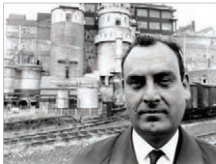
Figure 1: Ian Nairn, an outraged and outspoken critic of mediocre British planning and design.

In the case of Britain, the solution involved the implementation of a rigorous town and country planning legislation and