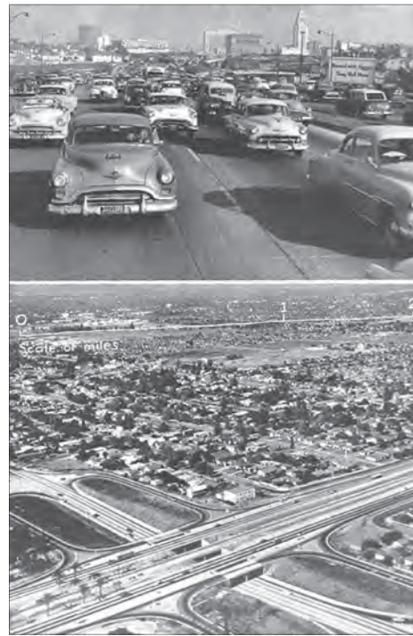
Figure 6: Views of Los Angeles in Counter-Attack Against Subtopia (Nairn, 1956: 354).

A review of Nairn's book published by The New York Times in