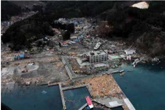
An aerial view of damage to Otsuchi, Japan

Millions of tonnes of waste were estimated to have been generated by the earthquake and tsunami in Japan. With natural disasters becoming more common, should nations have better prepared infrastructure and plans to cope with such quantities? And what about recycling opportunities? Nazli Yesiller investigates.