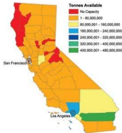
Figure 1. Disposal capacity available in California

available disposal capacity in the two major metro areas of Los Angeles and San Francisco are presented in Figure 2a and 2b. The available waste disposal capacity in the Los Angeles area is on the order of 940 million tonnes, and in San Francisco area the capacity is approximately 216 million tonnes. For the case of a major event that may occur in the city of San Francisco, the available disposal capacity is on the order of 28 million tonnes in the closest areas that are connected by land transportation to the city (i.e., San Francisco and San Mateo counties), with all of the capacity available in San Mateo county in a single facility and zero disposal capacity in San Francisco county (Figure 2b). Similarly, the problem exists on a global scale. For instance, in Germany and Japan where landfill is not the preferred disposal option in the waste hierarchy. Total lack of landfill capacity is reported for multiple regions in Japan, where existing facilities have filled up and construction of new facilities has not been possible due to geographic constraints (terrain as well as population density).