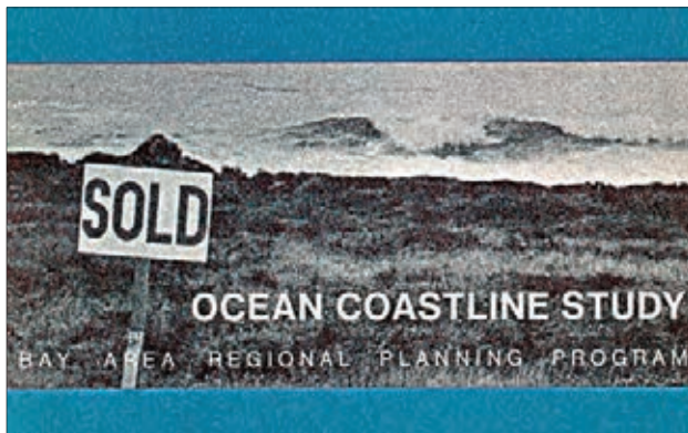
An example of a report from ABAG's first decade.