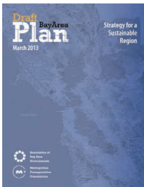
Plan Bay Area, adopted July 18, 2013.

These efforts have resulted in the Plan Bay Area, a state-mandated, integrated long-range transportation, land-use, and housing plan that will support a growing economy, provide more housing and transportation choices and reduce transportation-related pollution in the nine-county San Francisco Bay Area. The Plan Bay Area was adopted on July 18, 2013. 3 It builds on earlier efforts to develop an efficient transportation network and grow in a financially and environmentally responsible way. It is a work in progress that will be updated every four years to reflect new priorities. By planning now, the Bay Area will continue to be a great place to live, work, and play for generations to come.