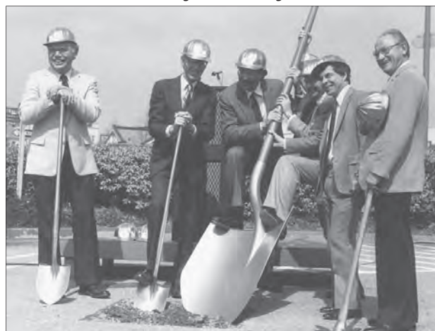
The MetroCenter ground breaking, 1987.

ABAG readjusted its role from mainly a regional planning organization to more of a service agency for local jurisdictions, which helped restore a measure of financial security to the agency. Since the early 1970s, it has engaged in a number of service-oriented projects including seismic safety research and planning, pooling local credit risk to save local agencies money, launching a series of innovative service programs to finance economic development, and aiding regional energy conservation efforts.