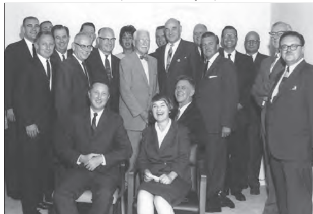
A historic photo, the ABAG group in 1964.

After the Truax incident, ABAG had to concentrate on staying solvent and retaining its membership. A great deal of dedicated work by several leaders—including San Francisco