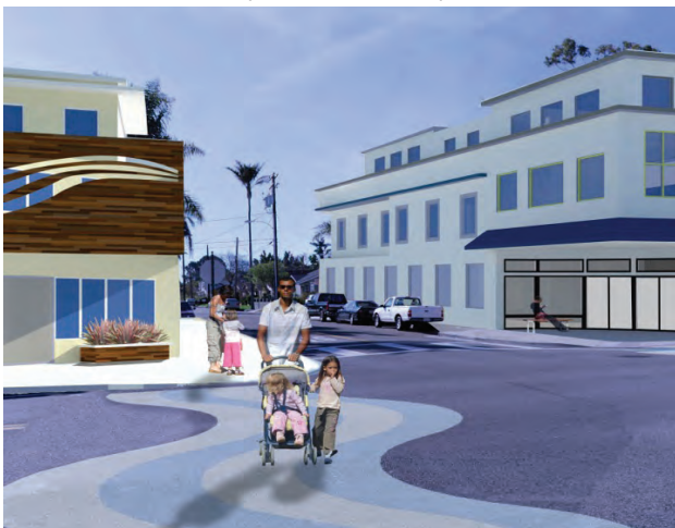
Conceptual scenario of Carpinteria's downtown.