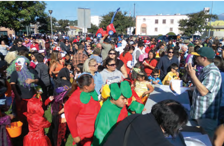
Community meeting in the park during the work at Santa Paula.