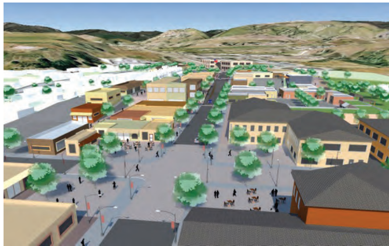
Proposed design for the Avenue of Flags, Buellton.

Responding to a request from the City of Atascadero and the San Luis Obispo Council of Governments (SLOCOG) an undergraduate studio (CRP 203) and a graduate studio (CRP 553) collaborated on the South El Camino Real Corridor Urban De-