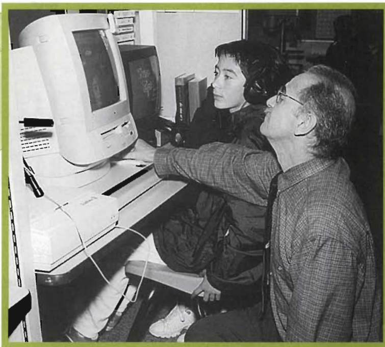
Poncé works with a student at a digital imaging module.

Both teachers, who gained access to Cal Poly through its