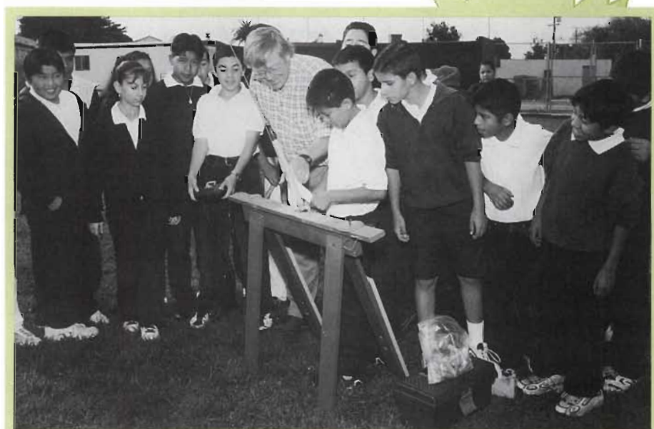
Anderson helps students launch rockets they have designed and assembled.

Note: Cal Poly's EOP celebrated its 30th anniversary in 1998. CP