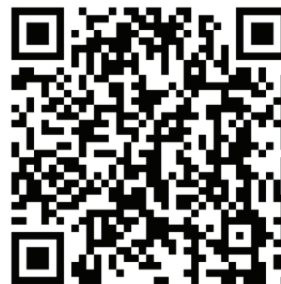
Figure 2: GST generated QR code.

QR Codes are a way to connect printed content with online content. In that sense, an outreach process would be able to use this technique to make information on the Garden Street Terraces project available at the moment of need. For instance, a QR Code can be posted to provide a map when it is important to give visitors directions without making photocopies. Infor-