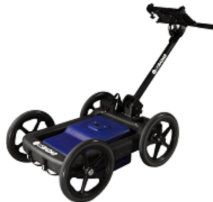
Figure 2: US Radar Inc. Q25C Deep Utility Locating System