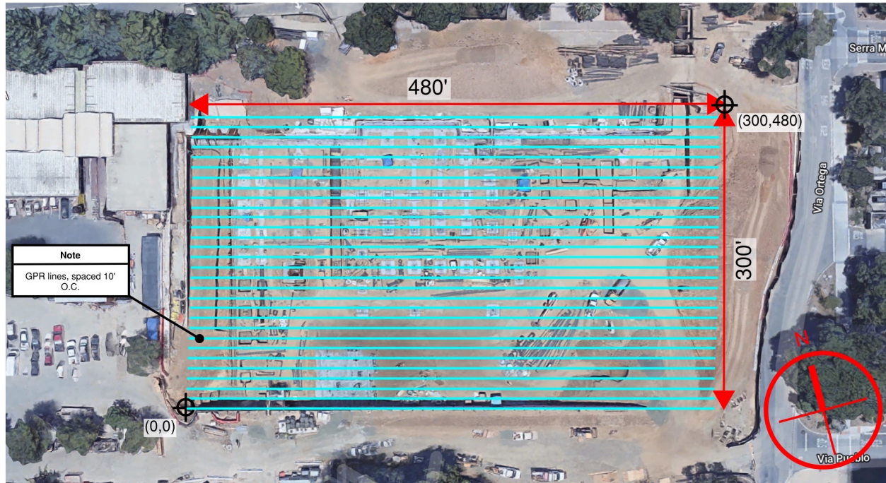
Figure 6: Representation of the survey lines used by GPR on Stanford University's ChEM-H & SNI Building