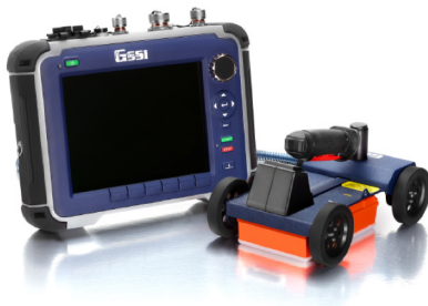
Figure 1: GSSI Structure Scan Pro

Due to the popularity of GPR, there are various commercial vendors and GPR models in the market today. Companies such as GSSI and US Radar Incorporated offer special GPR models for specific jobs. Products range from a basic GPR system like Mala Geoscience's El Pro Widerange GPR to US Radar Inc's Q25C Deep Utility Locating System that specializes in reaching depths up to thirty feet. In fact, GSSI created a GPR system called GSSI Structure Scan Pro that is the size of a small tablet and specializes in shallow (18 inches) versatile concrete inspection. The wide range of GPR products ensures there is a GPR system for every application.