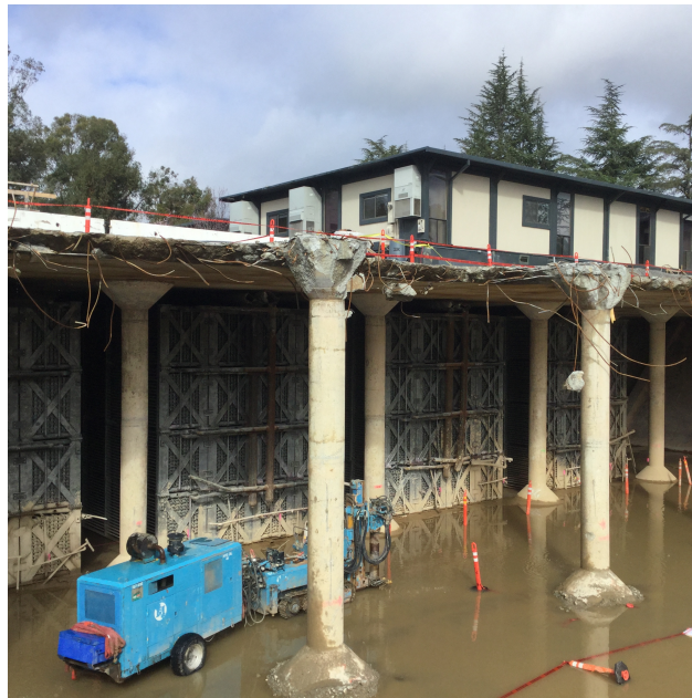
Figure 5: Photo of semi-excavated Ice Tank

Assuming further testing revealed that GPR would be viable, the author worked with Mr. Kirker to design a GPR survey. When using GPR on a rectangular area such as the ChEM-H building site, the best practice is set gridlines every 10 feet. As seen in figure 6, the size of the GPR scan for this site is about 300 by 480 feet in size, and the bottom left corner of the site is set as the origin (0,0). The site can then be visualized as a coordinate system with the top right corner being the last coordinate (300,480). Next, the GPR unit is placed at the origin, and the unit's GPS system is set to these local coordinates. The operator then pushes the GPR unit east along the survey line at a constant slow-walking pace until reaching the edge of the site at point (300,0). The operator then moves 10 feet north to point (10, 480) and walks along the subsequent survey line to the west. This process is repeated until each survey line has been covered. For a survey this size, it was estimated the field work could be completed in one or two days. Perhaps more importantly than the duration of the work, these surveys can typically be performed months prior to the beginning of construction, giving the project team significant lead time to plan for the excavation.