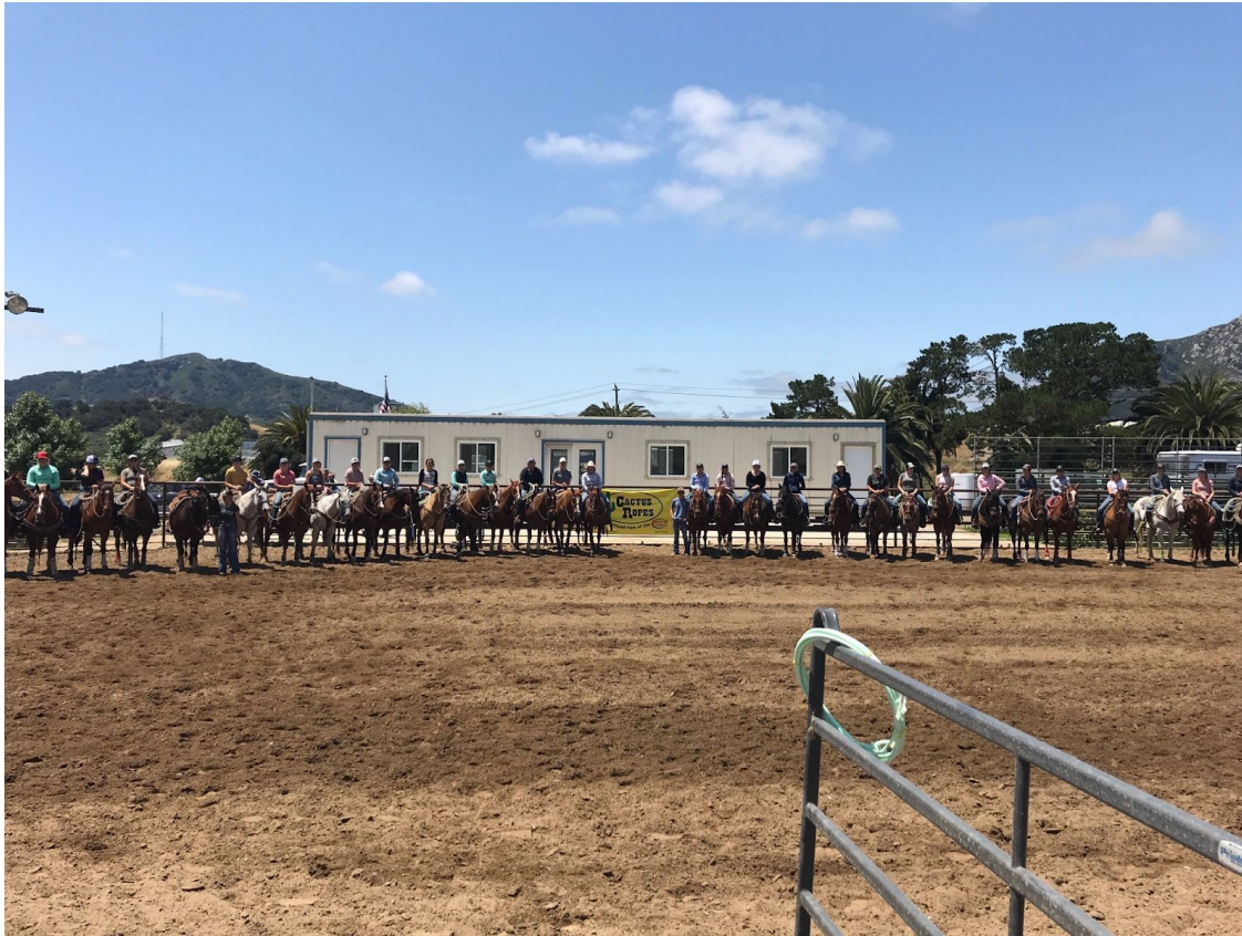
42 contestants entered in the Cactus Hooley Jackpot!