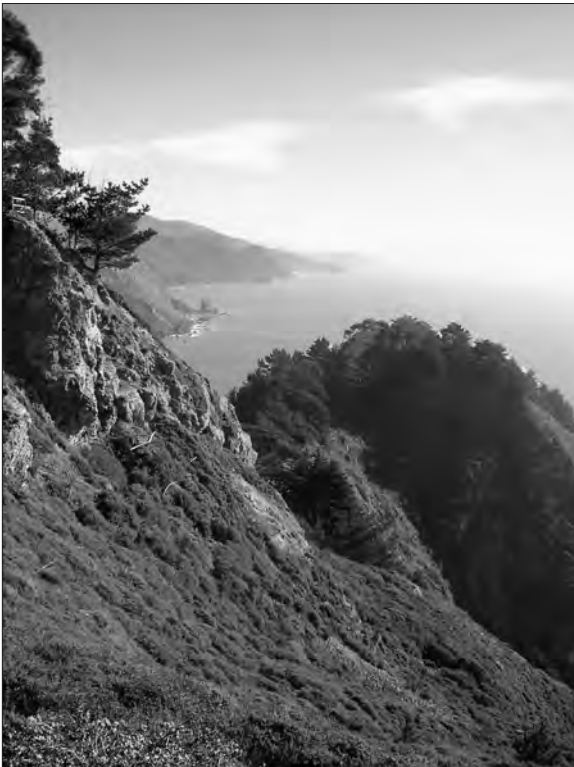
Figure 2 Muir Beach vista point.

suspect that my involvement in Toastmasters factored into the decision by upper management in Caltrans to transition me into Regional Planning from Systems Planning beginning January 2011. As the new Regional Planner for Santa Barbara County, I serve as the liaison between Caltrans, the Metropolitan Planning Organization (MPO) for Santa Barbara County, and the Santa Barbara County Association of Governments (SBCAG). I facilitate state funding for SBCAG and provide support on Regional Transportation Plans (RTPs), Overall Work Programs (OWPs), and transit studies. I also