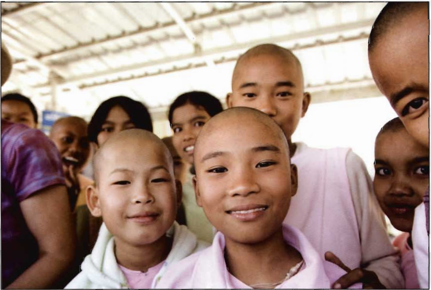
Young nuns at the top of Taung Kalat, Myanmar (Burma)