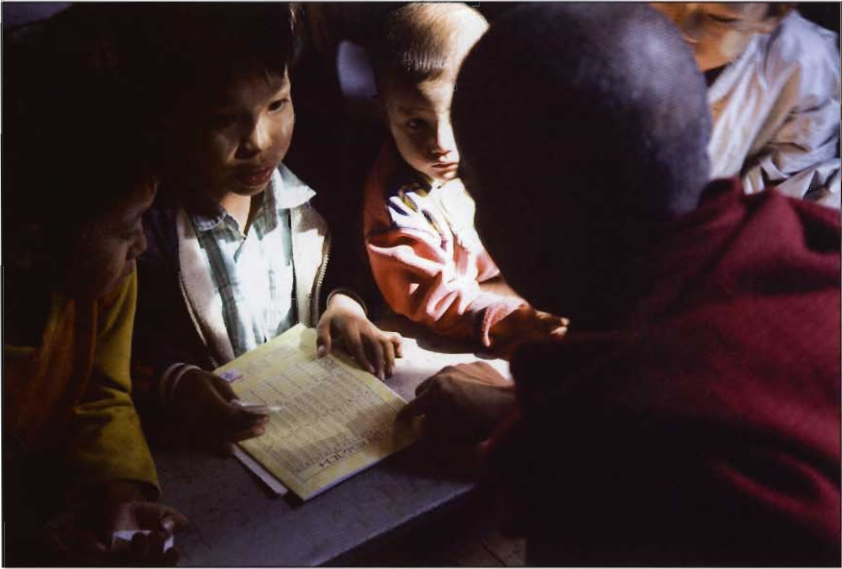
School at the Bagaya Wooden Monastery, Inwa near Mandalay, Myanmar (Burma)