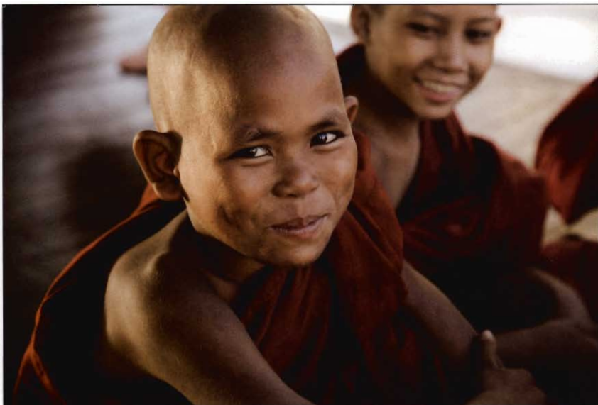
Young monk at the Shwedagon Paya, Yangon, Myanmar (Burma)