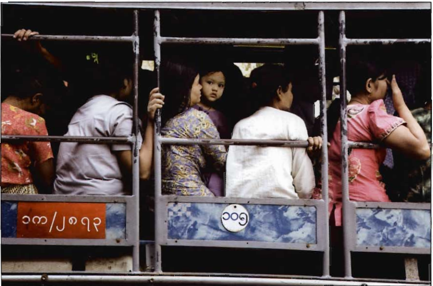
Buses on the streets of Yangon, Myanmar (Burma)