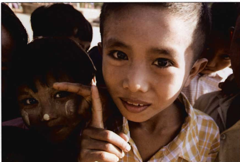
Children at a Festival in Bagan, Myanmar (Burma)