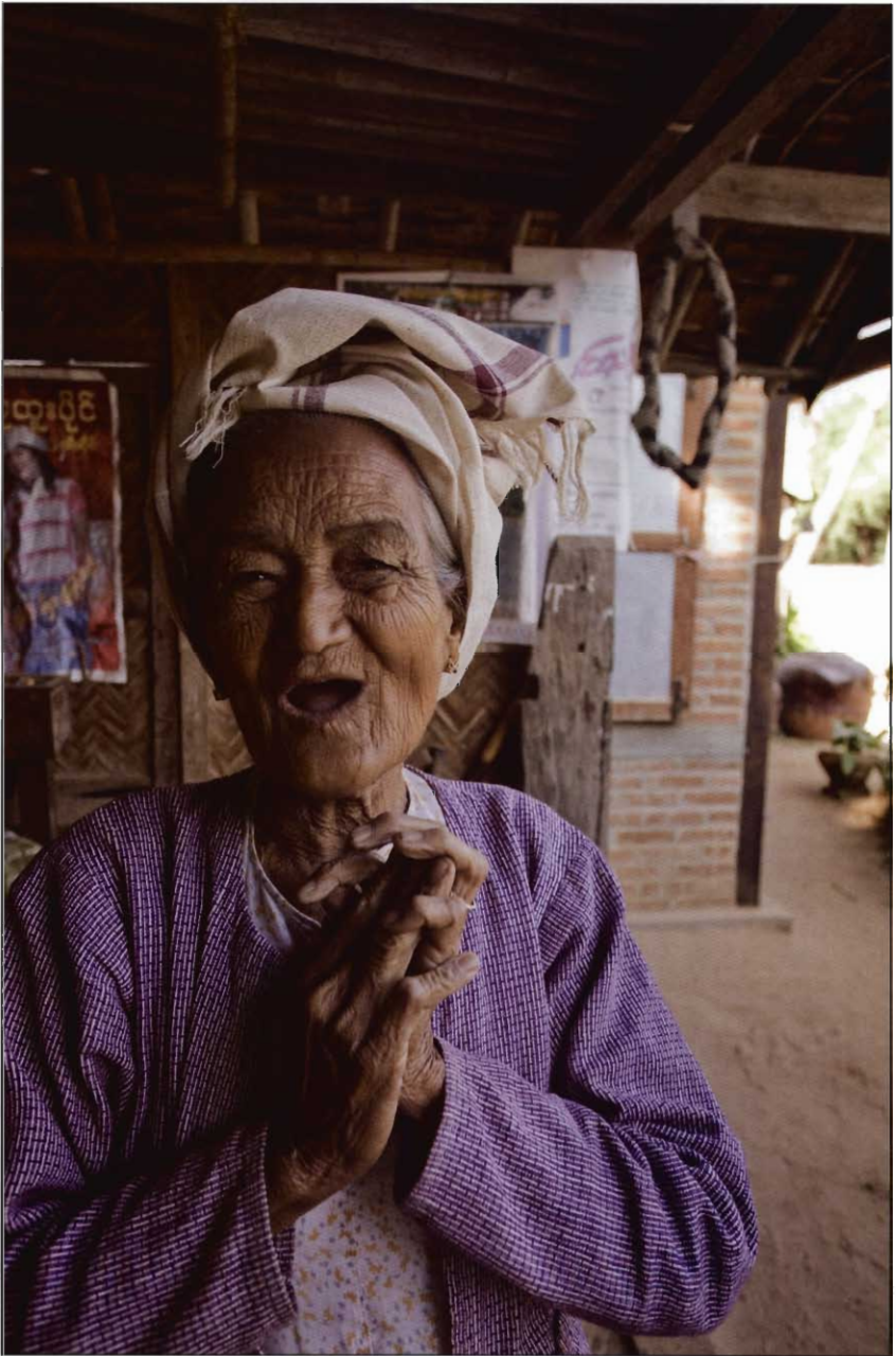
Pwa Saw Village, Bagan, Myanmar (Burma)