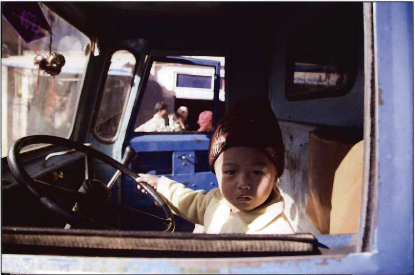
Kalaw Market, Kalaw, Myanmar (Burma)