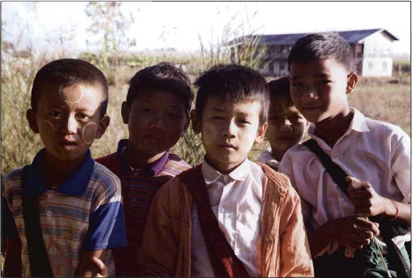
On the way to the floating market, Inle Lake, Myanmar (Burma)