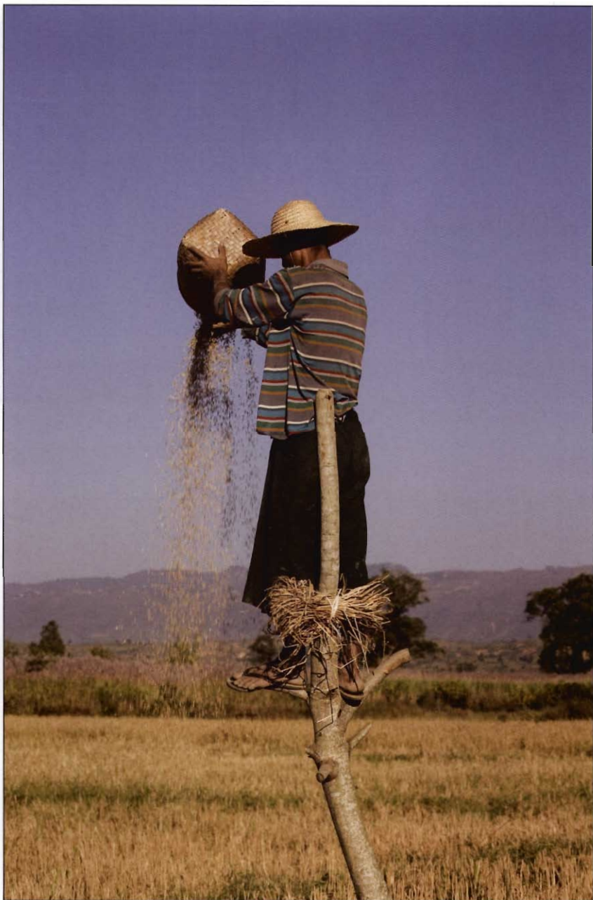
Harvest along the way to Inle Lake, Myanmar (Burma)