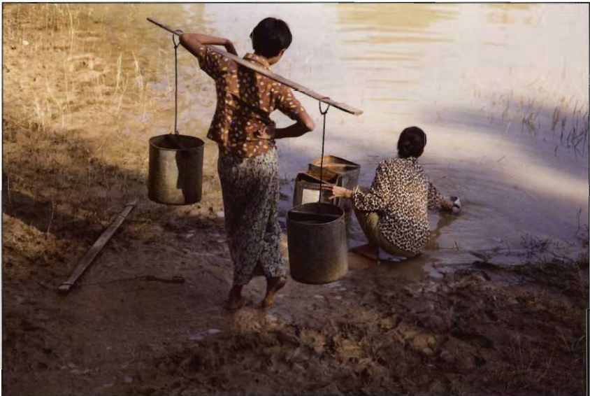
Mother and Daughter getting water for the day, Minn Nan Tu Village, Bagan, Myanmar (Burma)