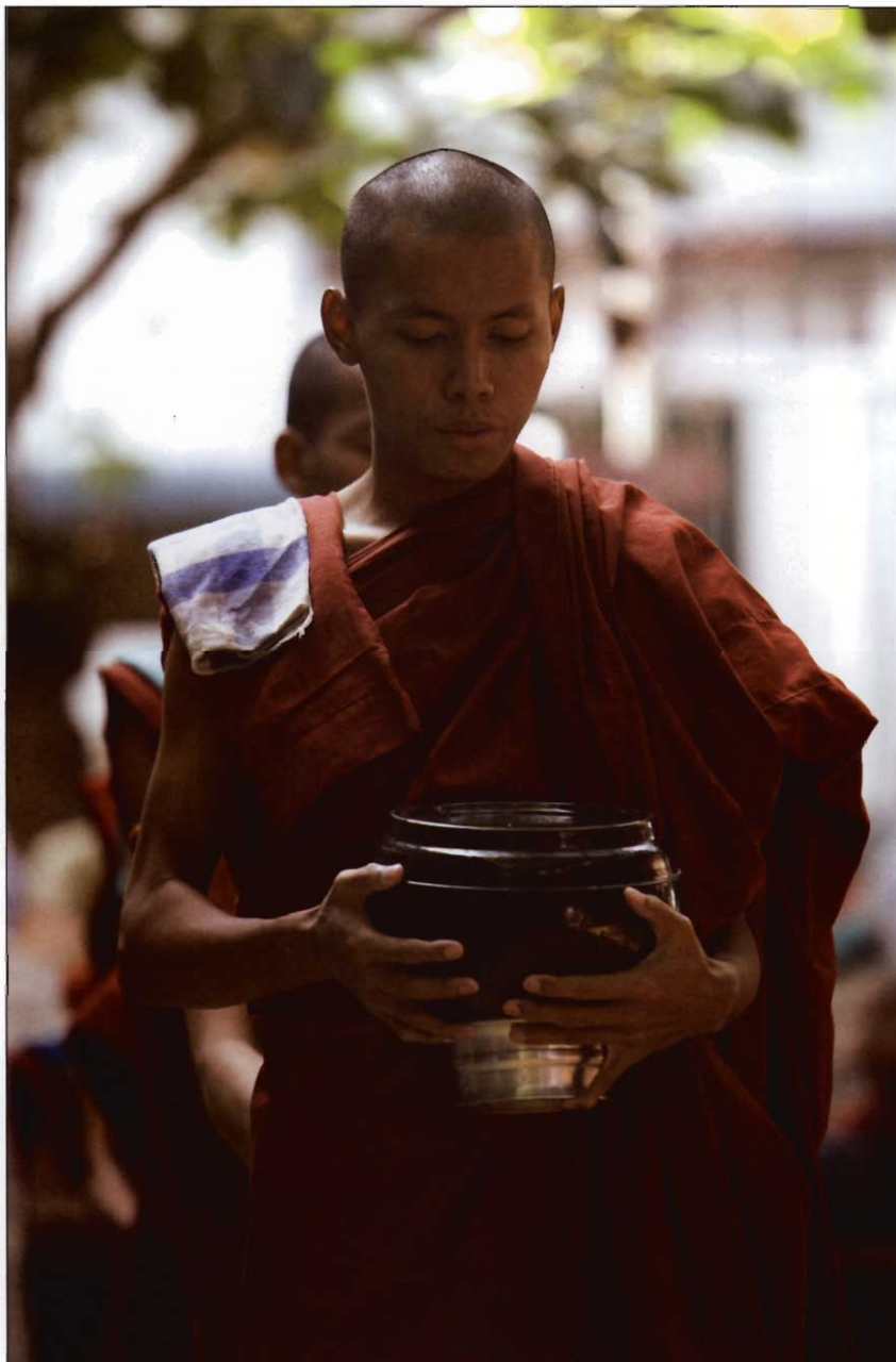
Monks receiving their daily meal at Maha Ganayon Kyaung Monastery, Amarapura Near Mandalay, Myanmar (Burma)