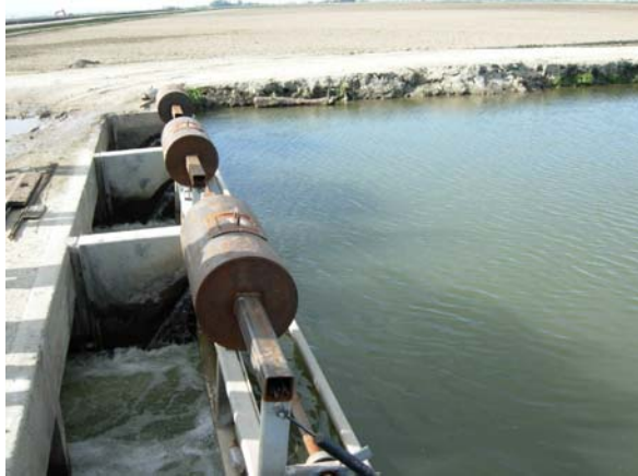
Figure 5. Three ITRC flap gates in parallel at San Luis Canal Company. These require no electricity, but must have a drop. There are hundreds of these throughout California.