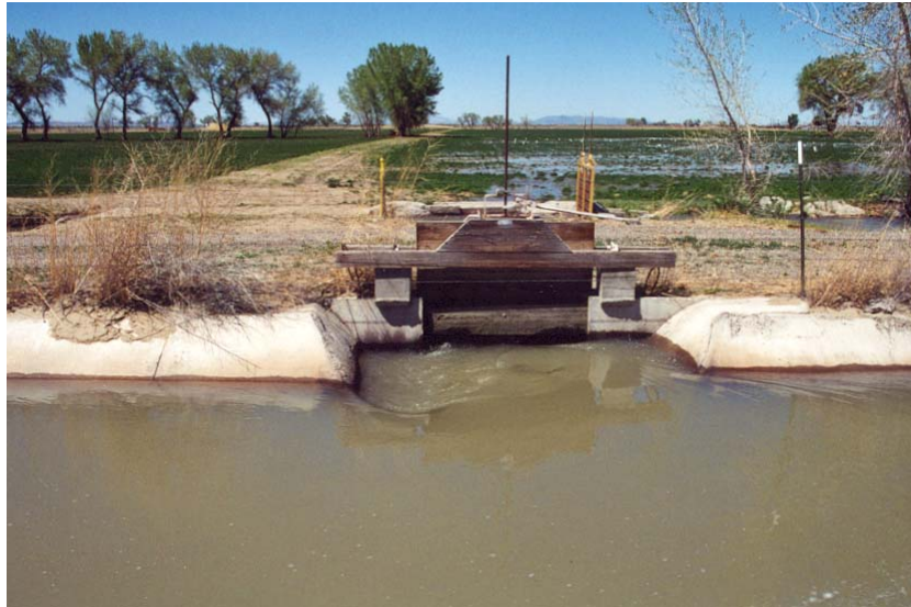
Figure 7. Example of poor entrance conditions into a field turnout. This is not in California.