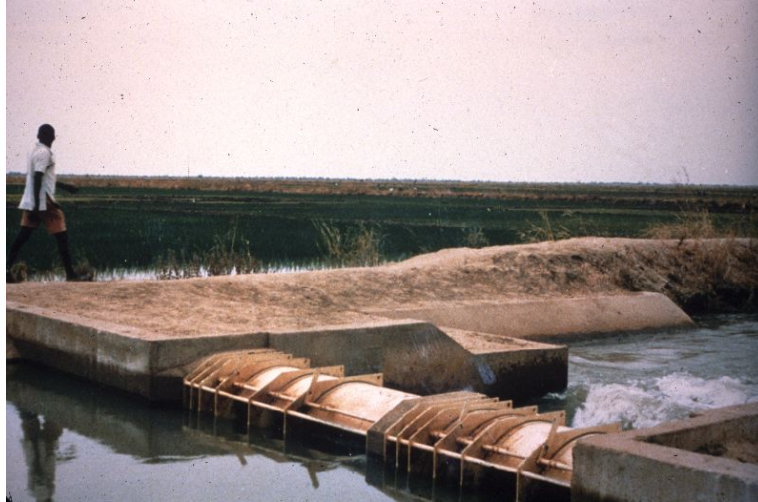
Figure 1. Baffle gates in Africa. Old, inappropriate technology for California.

What we need now is the ability for the district to not cause an unwanted flow change through a turnout. For example, over the course of a day the flow rate required by a drip system will constantly change. Every time the filters backflush, an additional 200 GPM or so might be needed for 10 or 20 minutes. As the water is moved between field blocks of varying sizes, the flow rate requirement changes. A center pivot sprinkler will turn end sprinklers on and off as it moves around a field. Therefore, farmers need the flexibility to change their flow rates easily, without constantly having to notify the district, and without needing to adjust their turnouts.