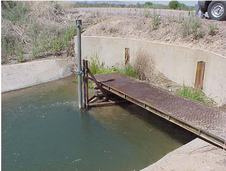
Figure 13. Propeller meter in a typical installation, facing upstream into a full pipe