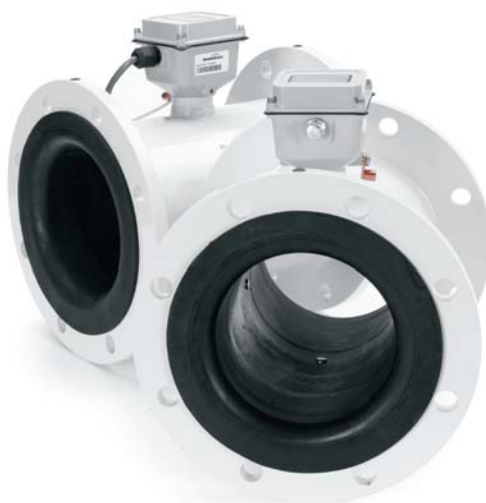
Figure 10. Two different models of mag meters.

Mag meters. Many of the problems experienced with propeller meters (trash plugging, wearing of bearings, and the requirement of a long, straight inlet and outlet section) are eliminated with some of the newer magnetic meters (called “mag meters”) of a spool design, as seen below. Some of these are battery operated. There is a large difference in quality among manufacturers. Also, there are limited models available in sizes greater than 6” or 8”. ITRC testing has shown very accurate results from some mag meters, and less-to-horrible results from others.