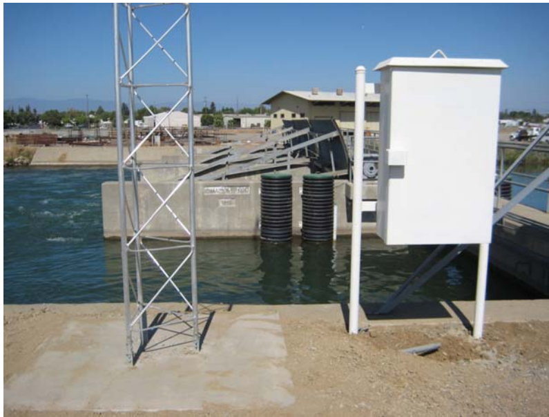
Figure 3. Automated radial gates on Glenn Colusa ID main canal at IID. Radio tower and instrumental enclosure for a PLC are in the forefront.

In the case of turnouts that need a constant flow rate versus time (such as with much of the surface, or flood, irrigation), irrigation districts attempt to maintain a constant pressure on the turnouts. This is done in canals with special canal dams called “check structures” that are designed to maintain very constant upstream water levels, regardless of the canal flow rate. These effective check structures can vary from very sophisticated PLC (programmable logic controller) controlled gates to very simple ITRC flap gates or long crested weirs.