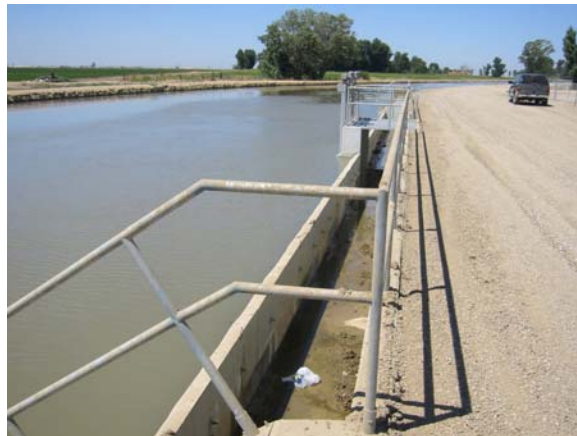
Figure 6. Special entrance to a 200 AF regulating reservoir at Central California ID. The sluice gates in the center are automated to open if the water level gets too high. Pumps at the upper right hand side (not seen) empty the reservoir if the water level in the canal gets too low. The long walls are for emergency spill into the reservoir.

One of the ways we try to provide good on-farm irrigation flexibility while also minimizing spills is to use specially designed pipe systems to make up what is known as “downstream control” of canals, and regulating reservoirs. This is a whole topic in itself, and expensive.