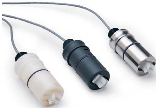
Figure 12. Three models of paddle wheel flow meters.

Insert meters of any type. There are many types of “insert meters” – including small paddle wheels and mag meters. They are relatively inexpensive because they can be inserted into a tapped hole on a pipeline. But, because of their small sample area, they are extremely sensitive to poor entrance/exit conditions. Furthermore, they tend to accumulate trash (because they stick into the flow) or sometimes have cheap bearings that seize up and stop rotating. Many have been tried in irrigation districts; I am not aware of any large successful, sustained usage of them on turnouts.