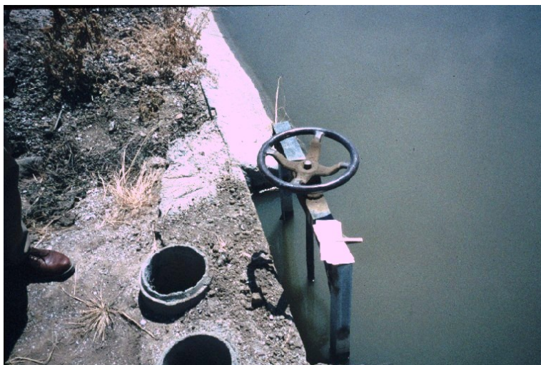
Figure 15. A classic metergate installation. The two round holes are stilling wells to measure the water level in the canal, and downstream of the gate. The gate is in the closed position in this photo (the stem is down).