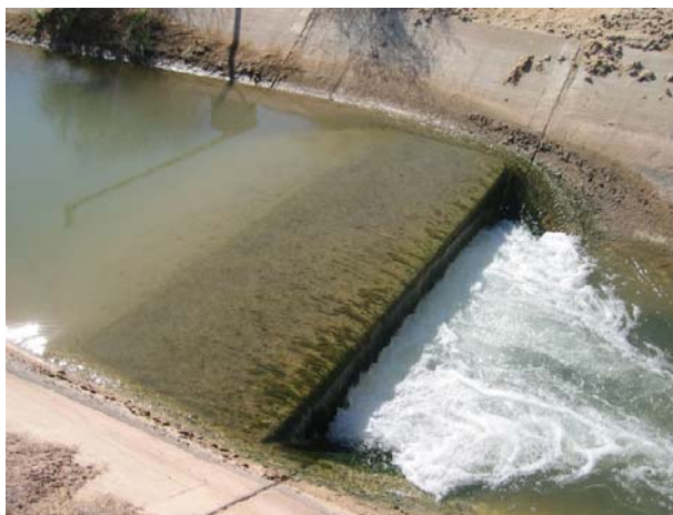
Figure 17. On-farm flume with maintenance issues, installed in a slip-form canal

Weirs and flumes. Some districts have attempted to use weirs or flumes downstream of the on/off and flow adjusting gate. These can work very well if there is a large elevation drop between the field and the canal. But the remaining challenging installations are usually found in flat topography, and in general flumes and weirs are not recommended because they become flooded (they are highly dependent on downstream hydraulic conditions) in flat ground. These were very popular in the inter-mountain West on old USBR projects because there was often a lot of elevation gain.