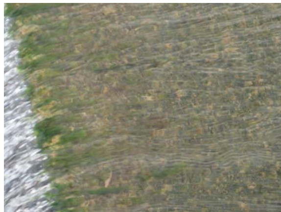
Figure 8. Several inches of algae and sediment on the crest of a flume. The water depth therefore gives an incorrect indication of flow rate.