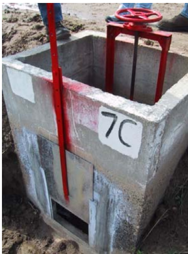
Figure 16. CHO at Alta ID. The orifice (on the canal, upstream side) is a standardized rectangle with an adjustable, bolt-secured opening. The downstream gate with the round handle is used to adjust the flow rate to the target.

Constant Head Orifice (CHO). This is another variation of the IID-style turnout. To avoid having the hydraulic condition change from submerged to free-flow on the downstream side of a fixed orifice, a second gate is installed. The second gate is used to turn on/off, and to adjust the flow while also keeping the downstream side of the first orifice flooded. The first orifice is usually adjusted once to make sure that everything works out as intended. Alta ID has a variation of this type of device.