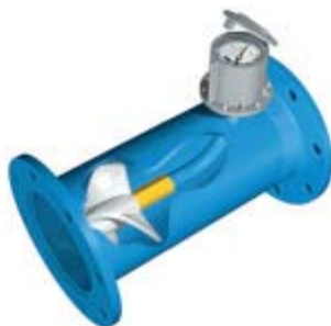
Figure 9. Typical propeller meter in a prefabricated, flanged section.

The old standby, depicted below, is the propeller meter. With correct installation and maintenance, it is generally understood to be within about 2-3% accurate over the rated range of flows and volume.