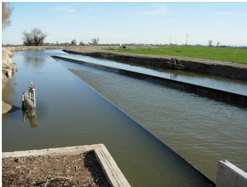
Figure 4. Very long, but simple, long crested weir at San Luis Canal Company. California has many hundreds of these structures.