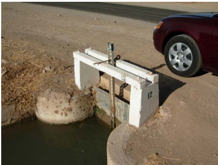
Figure 14. Imperial Irrigation District turnout. The gate opening and difference in head are measured for a known size of gate. The blue slip of paper in the hole near the top is left behind by the zanjero (operator) to let the farmer know the measurements and flow rate.

Metergate. The metergate was depicted earlier in a drawing from an old Armco gate measurement book. These are very popular in California, on perhaps 30% of the turnouts in one form or another. They function the same as the IID gate, except for three differences: