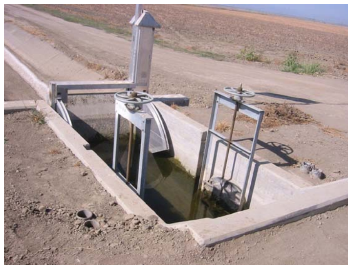
Figure 2. Example of an automated flow control turnout, with two adjacent manual turnouts

There are still various vendors of “modern” irrigation equipment that highlight the ability of their automated equipment to maintain a constant flow rate through the turnout. While this may be important for surface irrigation (such as in much of RD108 and Imperial Irrigation District), it is not what is needed for sprinklers and drip irrigation.