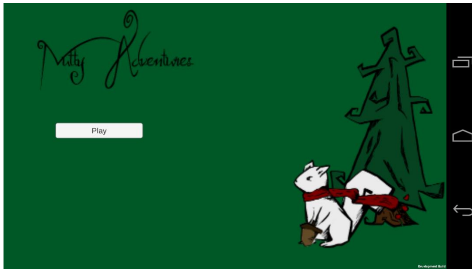
Figure 1 Menu Screen