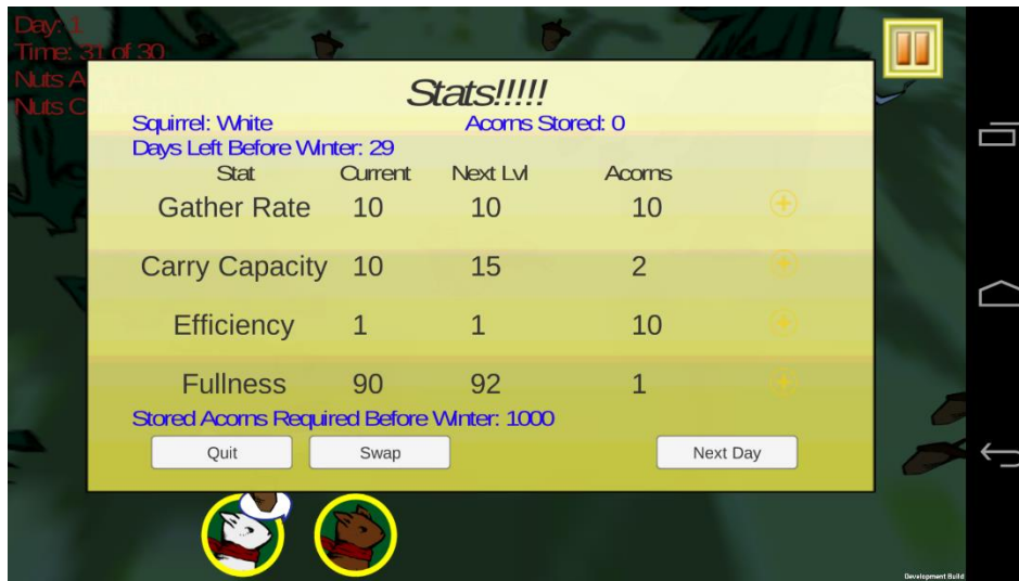
Figure 7 Stat Score Screen