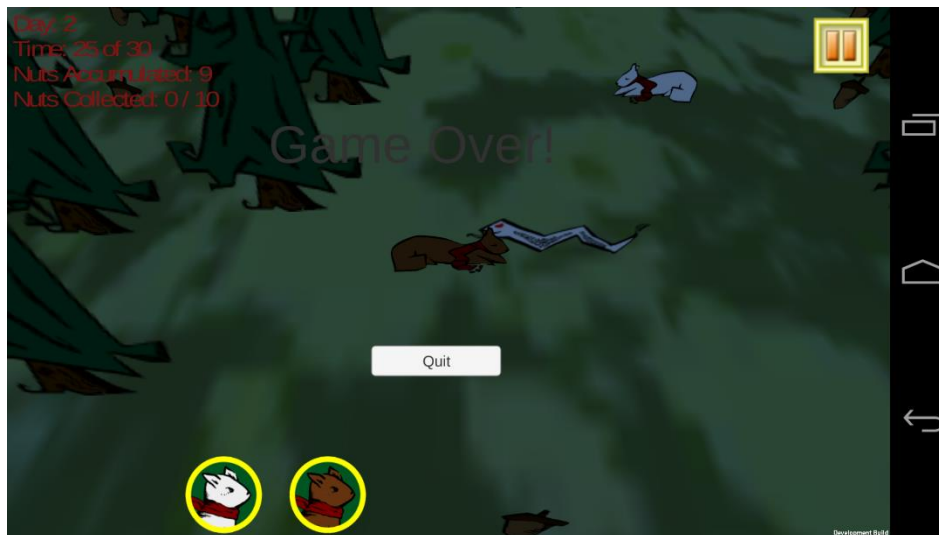
Figure 8 Game Over from snake killing both squirrels