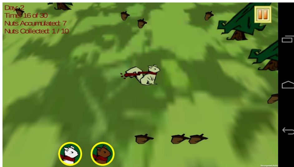
Figure 3 Lights Changed to Afternoon