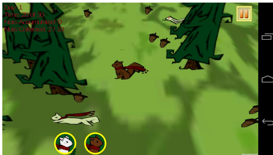
Figure 4 Enemy Spotted - Snake