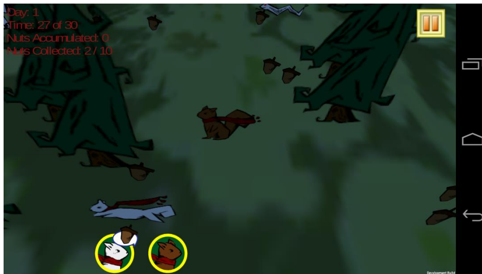
Figure 6 Still avoiding the snake at night and white squirrel has finished gathering from trees