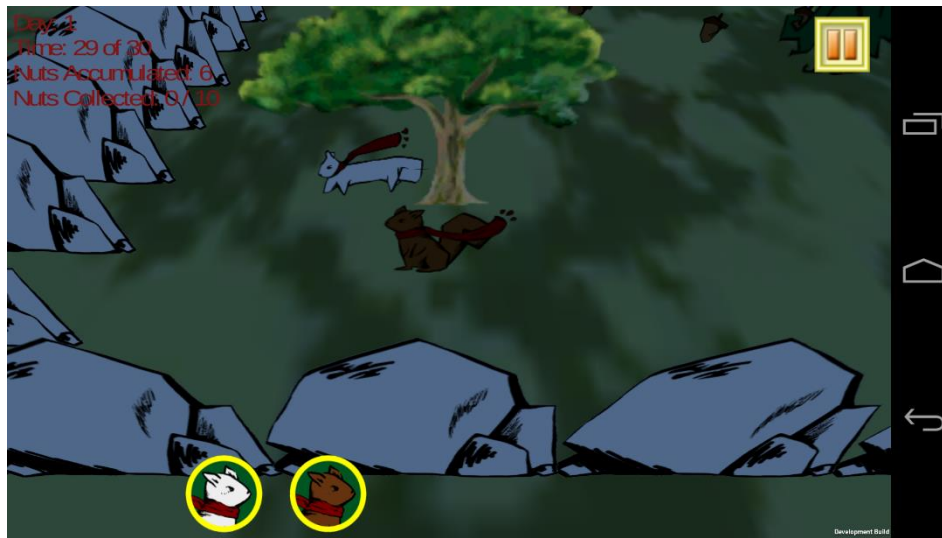
Figure 5 Lights Changed to Night