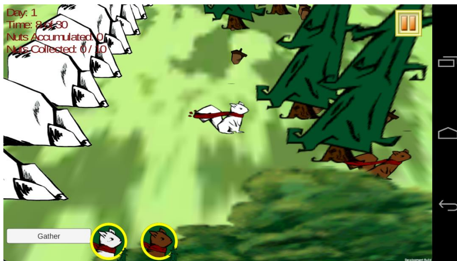
Figure 2 Start of a Game and squirrels are next to gatherable trees