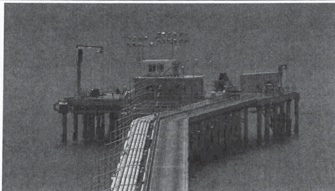
Figure 2. The platform at the south end ofthe pier facility where the majority ofthe current activity (i.e. course instruction, research, events, boat operations) occur.

The facility has two components, the base ofthe pier and the pier itself. The base ofthe pier is a two-acre open bluffand a parking area for vehicles. As the bluffhas restricted access, the adjacent rocky intertidal areas are protected and serve as excellent field sites with a rich and diverse array of flora and fauna, including a harbor seal haul-out. Approximately 200m off-shore, there is a 50 m wide kelp forest that transects the pier and has a resident population of sea otters as well as a subtidal kelp forest community.