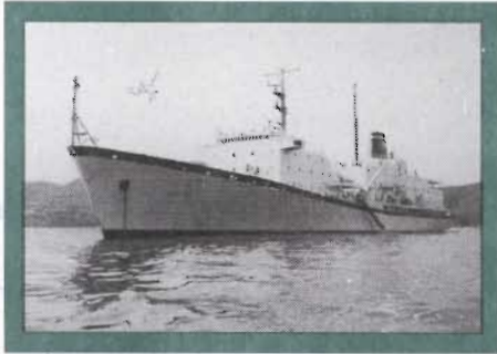
The Golden Bear