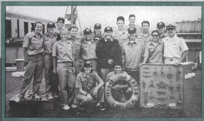
The Cal Poly crew plus one Academy cadet