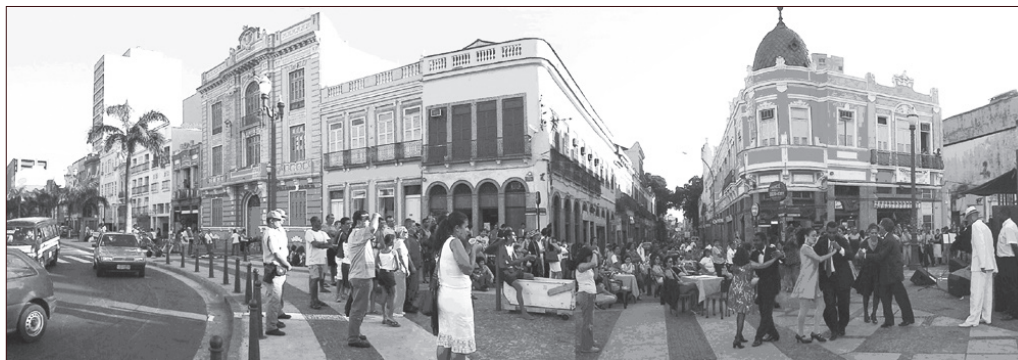
Figure 4 A street outside the area of the Cultural Corridor, was impacted and is now revitalized, with renovated public spaces, busy shops, and several street events.

The most important of such projects is the Cultural Corridor Project in Rio de Janeiro, Conceived in 1982; it was the first inner-city revitalization program in Brazil (del Rio & Alcantara 2008). Both a pioneering and an integrative effort, the project cancelled the modernist zoning and old renovation projects in the downtown. It encouraged the population to preserve the historical and cultural architectural heritage, promoted social and economic revitalization, and renovated the cultural role of the city center. The project is implemented through special design guidelines, tax abatements, specific cultural programs, and street renovation (Fig. 3). In 2004 the Cultural Corridor included more than 3,000 buildings, 75% of which had been partially restored and 900 had been totally renovated. In addition, the area received more than 25 new cultural centers, theaters and museums, and various street beautification projects. Last year, the first new residential complex for more than forty years was inaugurated and now contributes to add new life to the downtown. This successful urbanism is sustainable in many aspects, and it harmonizes architectural to social, cultural, and economic regeneration (Fig. 4).