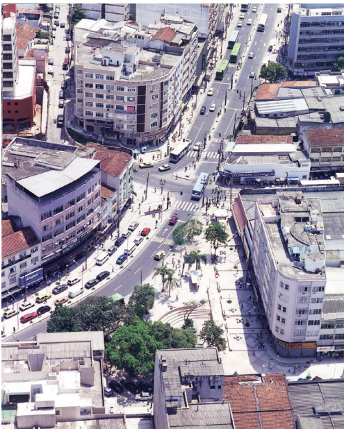
Figure 7 Projeto Rio Cidade renovated commercial corridors in Rio. A view of the project for Meier.

false identities, this project explored its own historical industrial architecture, the centrality of the area, and its accessibility by public transportation. Dozens of shops and eateries in recycled industrial buildings, new additions, interesting landscaping, and areas for public events generate an attractive mix. The DC Navegantes mall was expanded from its original site, and other private developers responded by converting other buildings and implementing more attractions that continue to revitalize the surrounding areas.