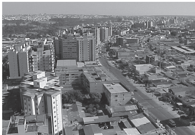
Figure 1 Taguatinga, one of Brasilia's irregular "satellite towns" from the early 1970s has a life of its own and is not dependent on the capital.

The planning and design of Brasilia also reveals a strong duality with the city's surroundings, where settlements that predate the new capital together with satellite towns and irregular settlements (favelas) have a much larger population than Brasilia itself, and show strong social and economic vitality (Fig. 1). As urban places, they are much more self-sustained than the capital, and they certainly permit the region of Brasilia to be socially, economically, and culturally sustainable as a whole.