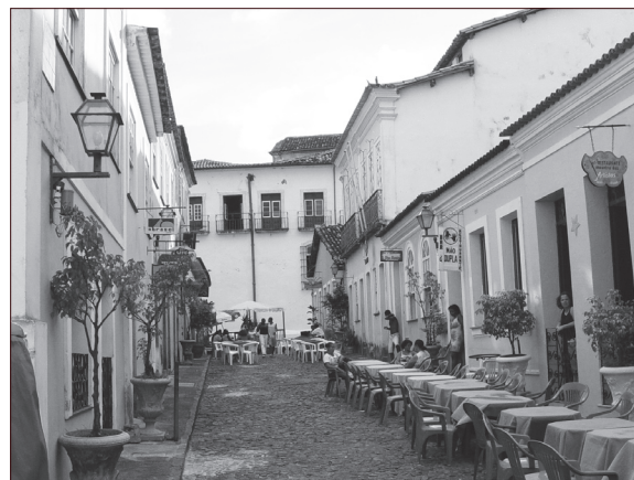
Figure 5 The Pelourinho area in Salvador after renovation has been revitalized with tourist oriented uses and events.

Even the private sector is promoting an urbanism of revitalization, like in the DC Navegantes; a popular outlet shopping center in Porto Alegre, Rio Grande do Sul. This project was totally planned and developed by the private sector that invested in the reutilization of a brownfield (Castello 2008). Different from post-modernist practices, which are based on