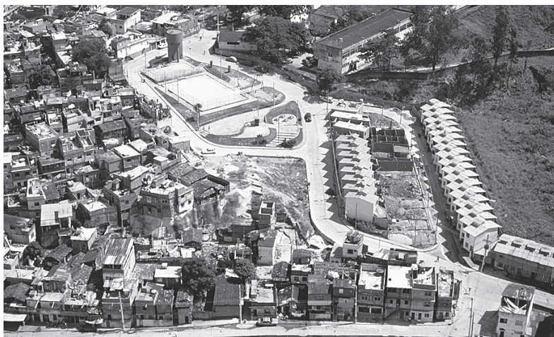
Figure 8 The Favela Bairro upgraded squatter settlements in Rio. A view of Favela Ladeira dos Funcionários, with new parks and residential units.

Although environmental, economic, and urban policies still have to be more decisively integrated, and environmental planning has to rely more on specific spatial and social expressions, the practices of urbanism in Brazil have advanced towards Godschalk's sustainability prism model in which all vertices are in a constant state of conflict but which results in a balanced environment having livability on the top (Fig. 9) (Godschalk 2004). While the ecological vertex is still to be more and better cared for, Brazilian cities have advanced significantly towards the equity, the economic, and the livability vertices. Hopefully, with the advance of democracy and public participation, in the next few years, we will see a more balanced and sustainable development model in Brazil, and particularly a better integration between environmental planning and urbanism.