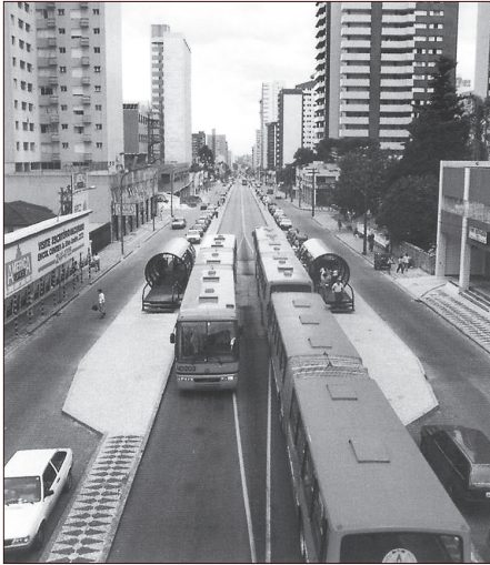
Figure 6 The dedicated express lanes for the rapid bi-articulated buses run along mixed-use dense corridors in Curitiba.