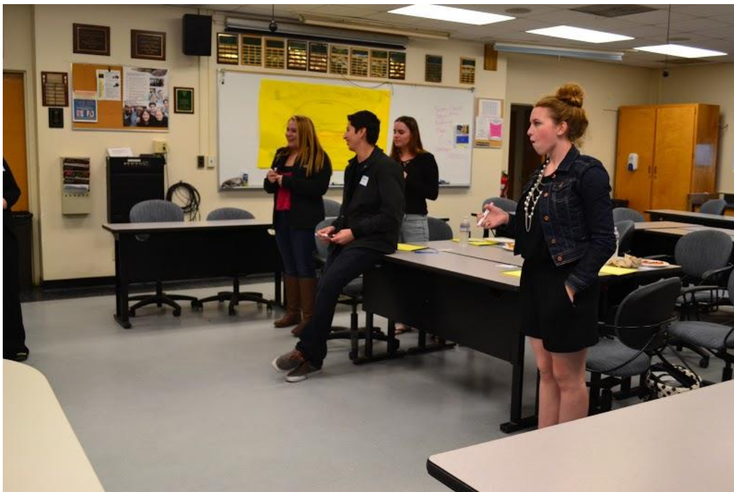
Figure 5. Nipomo FFA Students playing "Name that Tune"