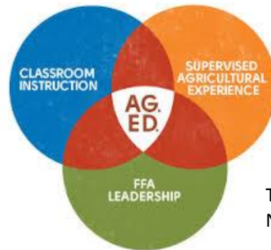
Figure 1. Three Circle Model