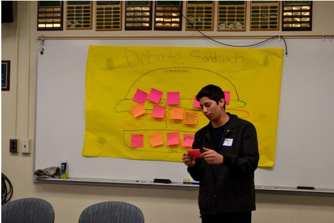
Figure 4. Nipomo FFA Student practicing debates.