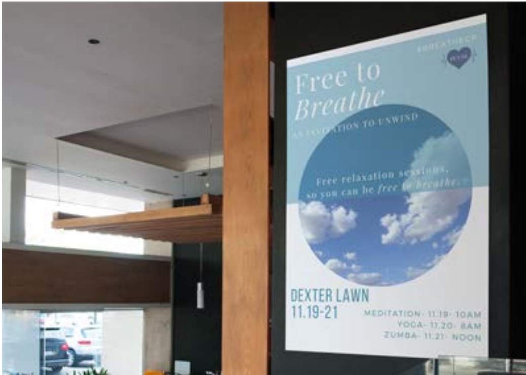
Figure 3: Sample Flier Mockup