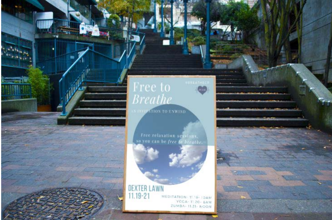
Figure 2: Sample Sandwich Board Mockup