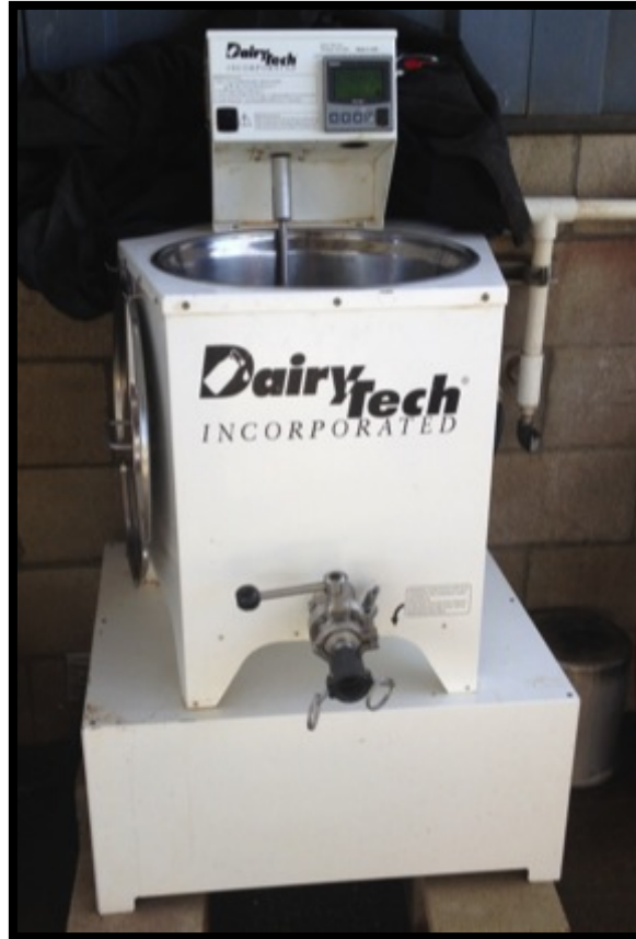
Figure 3. Cal Poly Dairy's 10 gallon pasteurizer.

Milk replacers are also an outstanding source of liquid feed for calves at a substantially lower cost to the producer compared to salable milk. It is less expensive per unit of nutrients, but is more expensive than waste milk. Some farms may have a supply issue when it comes to waste milk making it an advantage to feed milk replacers. If the waste milk supply is consistent it is the best practice to feed pasteurized waste milk to the calves. Consistency is key to calves' diets because it decreases the chances of digestive problems that may arise (Drackley, 2008).