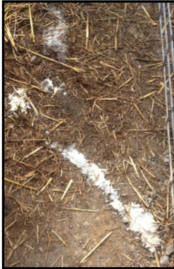
Figure 4. Example of diarrhea from a younger calf.

determines that it is diarrhea. Figure 4 exhibits a lighter color of scours in a younger calf, and Figure 5 exhibits a darker color of scours in an older calf.