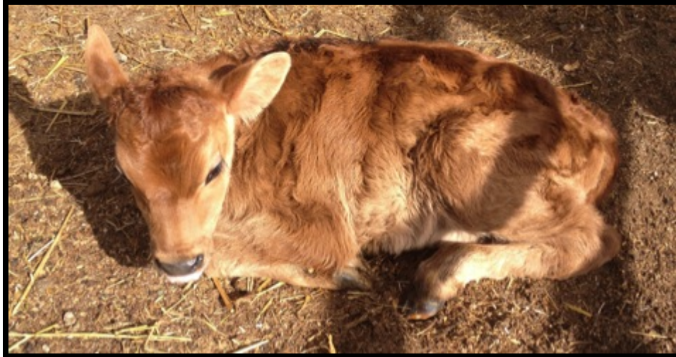
Figure 1. Example of the sternal recumbency position from the side view.