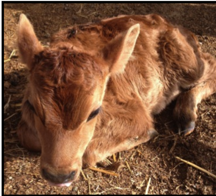
Figure 2. Example of the sternal recumbency position from the front view.