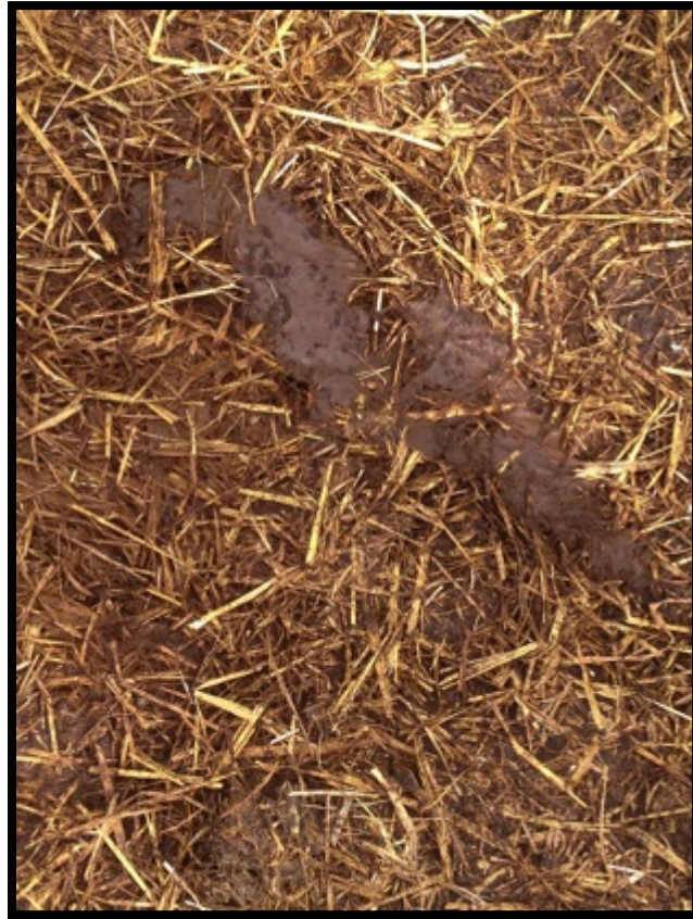
Figure 5. Example of diarrhea from an older calf.

shows how diarrhea can spread throughout the surrounding bedding if it is not removed and replaced with fresh bedding.