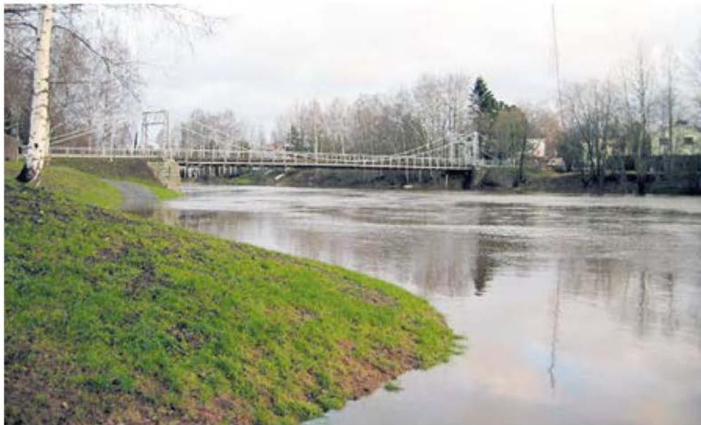
Figure 1. Kyrönjoki River in Ilmajoki Finland (Etelä-Pohjanmaa)

The idea of a flowing river 1 (Figure 1) fits this discussion on leadership as our journey through life is filled with numerous challenges and opportunities some of which are easy to negotiate and others of which are quite tumultuous. Navigating our journey of life to assure survival, happiness, sustainability, prosperity and so much more requires good leadership and management skills. Rarely are people born leaders but rather for most of us education, training, mentoring, and learning by doing experience are required to develop the leader and manager in each of us. The journey is both challenging and transcendent.