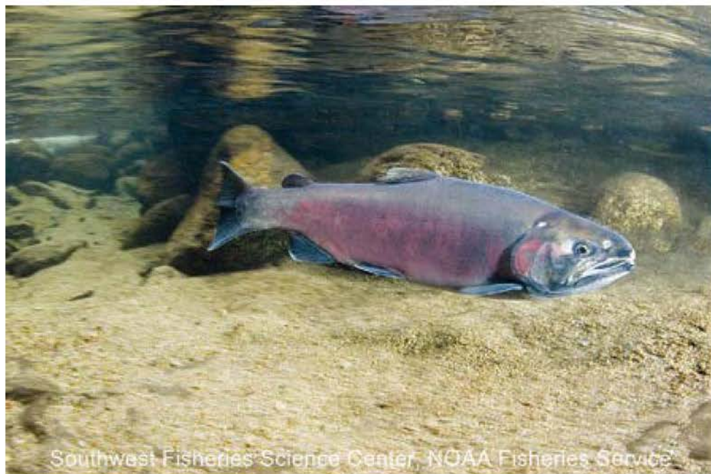
Figure 12. Coho Salmon in California Streams Requiring California Board of Forestry and Fire Protection (BOF) Leadership

Many people serving as leaders, managers and followers have and are affecting this entire forest practices regulatory process with roles changing as situations change. Issues facing the BOF vary from year to year with attention being paid to what is considered an urgent public need. Such issues as salmonid protection in relation to Water Lake Protection Zone (WLPZ) requirements was a major issue of consideration for a long period of time with final adoption of a rule package by the BOF around 2010 (Figure 12). Contemporary issues requiring BOF leadership action focus on such topics as climate change, fire protection requirements, road rules, land use pressures, forest health (e.g., Sudden Oak Death, Pitch Canker), working forest landscapes, and so much more.