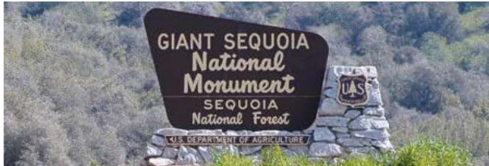
Figure 4. USDA Forest Service Giant Sequoia National Monument.

in giant sequoia groves led to several peer reviewed publications (Piirto and Rogers 2002, 1999a, 1999b; Piirto et. al. 1997a; Piirto 1994). Leadership occurs in many different ways by scientists, concerned citizens, and agency leaders as these examples clearly demonstrate.