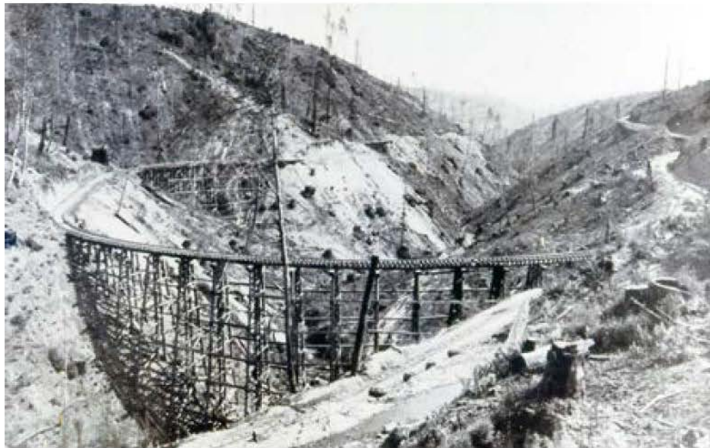
Figure 10. Little Creek Watershed at Swanton Pacific Ranch in Santa Cruz County around 1920

lumber to rebuild San Francisco was no small task. Whole forested landscapes were cut (Figure 10). Fortunately coast redwood stands are fairly resilient and have come back to wonderful second-growth coast redwood forests (Figure 11). However, many people objected to the unregulated cutting of entire landscapes no matter how noble the reasons. So in that context, California citizens have been and are actively engaged in what happens to forested landscapes on state and private lands through effective oversight by the BOF. Today forest land owners and Registered Professional Foresters must go through a very detailed environmental and public review before permits will be authorized to harvest timber for commercial purposes. These laws have evolved over time as a result of new legislation, evolving policy interpretation, and court decisions.