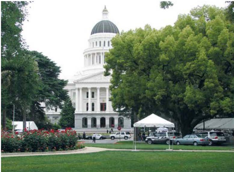
Figure 8. California Government—An Amazing Experience.

Leadership and management require that we get involved as has been previously mentioned. The degree to which we do get involved obviously depends on our life circumstances at the time. In 2007 I was appointed by the Governor and California Legislature to become a Member of the California Board of Forestry and Fire Protection (BOF). What an amazing experience that turned out to be. I served in that capacity for four years (Figure 8 and Figure 9). In that time frame I learned so much about myself and about California governance. None of that would have happened had I not stepped forward to take this largely volunteer appointment. At first I was somewhat intimidated by how much I would need to know and do in this appointment to the BOF.