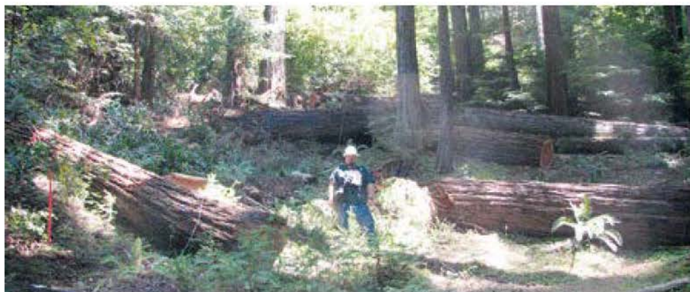
Figure 11. Little Creek Watershed Second Growth Coast Redwood 90 Years Later. Notice the 2008 selection timber harvesting that is currently occurring. A major change from what occurred in the early 1900s.