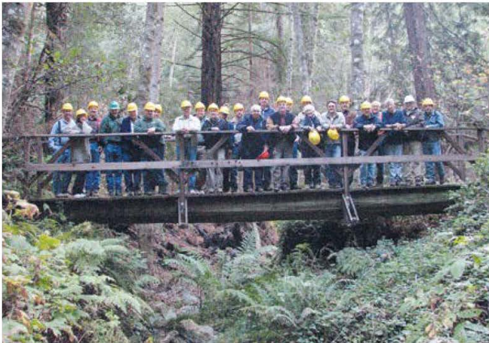
Figure 7. Photo of the NRES Advisory Council, A Network to Discuss Good Ideas.

Fourth, application of good meeting management (Frank 1989), effective communication (Carnegie 1962; Piirto 1989) and human relations (Carnegie 1936) principles learned from training and experience must be sincerely and enthusiastically applied to garner trust, respect, and most importantly teamwork.