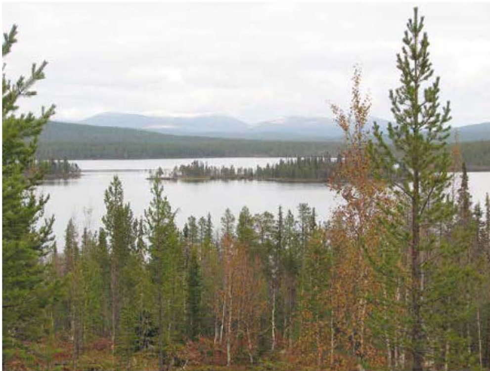
Figure 2. A Typical View of a Sustainably Managed Finnish Landscape

Picture Seinäjoki University of Applied Sciences (SeAMK) in South Ostrobothnia (Etelä-Pohjanmaa) in central Finland with its working farms and forests, flowing rivers and lakes, peatlands and blueberries (mustikka) with hard working Finnish (suomalainen) people living in harmony with the land (maa) and its wonderful variety of associated ecosystems. The Finnish people have led the way in their quest to achieve sustainability and balanced use. It was here in Finland (Figure 2) that I was asked to develop a paper and deliver lectures on leadership in forestry, natural resources, agriculture, and associated professional areas.