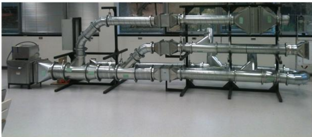
Figure 2 Air Duct Simulator Schematic and Picture