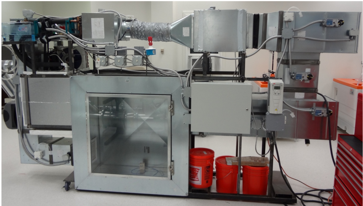
Figure 3 Air Handling Unit Simulator

By giving students a hands on laboratory device they get to see with their own eyes how air is conditioned. The students will have a better understanding of the material they are learning in the classroom and will gain practical knowledge of the components in air handling systems. The students themselves will be better equipped to design such systems themselves and will see increased confidence in their own knowledge of HVAC design and confidence in their analytical system calculations. It is hoped that from this simulator students will be able to enter into the HVAC industry with a better initial understanding of HVAC control and design."