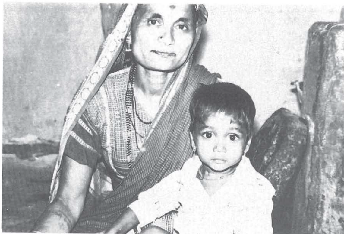
Plate 6 She is fulfilled in her role as wife and grandmother.