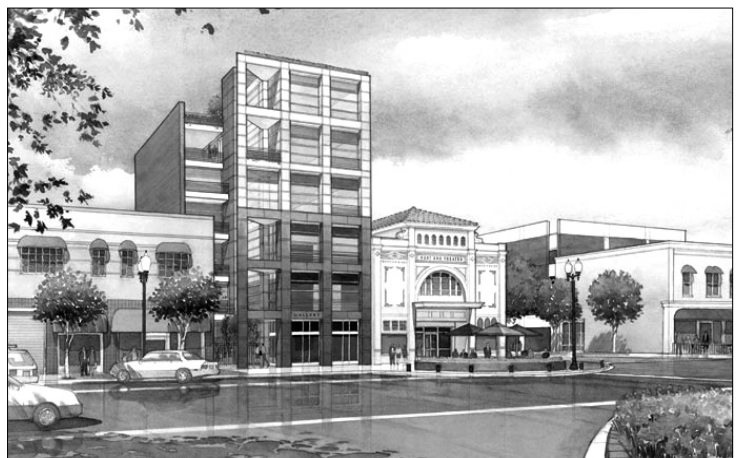
Figure 1 Artist's rendering of the West End Commercial Lofts in Santa Ana, CA.

The West End Commercial Lofts by Urban+West, a proposed project in Santa Ana, California, will be an example of a building planned for mixed use, but with flexible building design and development regulations that will allow its uses to transition if unsuccessful. Currently, the project is planned to include a six-story building with five floors of flats and ground-floor retail, but the building will be designed so that the uses could vary as a response to changing market conditions. Its design would potentially allow the building to be used for a mix of office, residential, and retail depending on which uses prove more viable at that location over time. The City of Santa Ana is employing a creative zoning