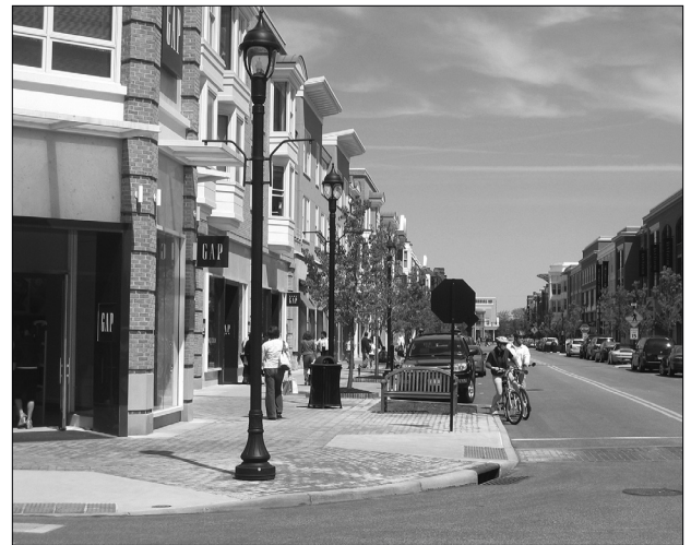
Figure 6 Pedestrians and bicyclists can easily navigate the streets of Crocker Park, assisted by traffic-calming solutions. Bulbouts at intersections also serve as gathering areas, where benches provide places to rest and people-watch.