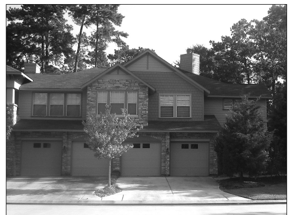
Figure 4 A multi-family building in Woodlands.