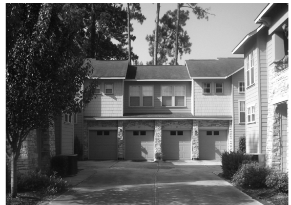
Figure 3 The motor-court, a housing types in Woodlands.