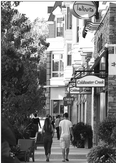
Figure 5 Crocker Park, Westlake, OH. In spring time the developer places hundreds of potted plants along sidewalks to foster a lush garden feeling.

The concept for Crocker Park dates to the late 1990s, when the city of Westlake was deciding how to develop one of its few remaining commercial parcels. Although the upscale community had an underserved retail market, the city did not want to build "just another retail mall," and Stark Enterprises came forward with plans for a mixed-use town center. However, the city had an "ultra-Euclidian" zoning code, in which their planned unit development (PUD) did not allow for mixed-use development. In order to change the zoning of the site to allow for mixed-use development, a city-wide referendum was held in 2000. It passed, but not without controversy. Not all staff or elected officials were in favor of the project, and Stark Enterprises embarked on a door-to-door campaign to gain support from residents.