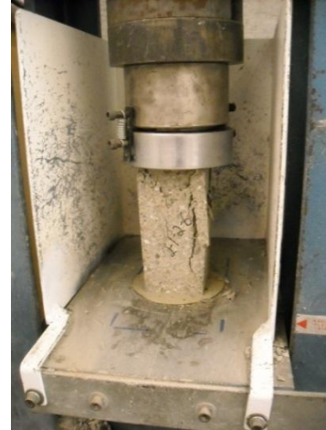
Figure 5: (a) Capping of Grout Compression Specimens and (b) Compression Testing

Four walls were constructed by professional masons in one lift for the Wall Experiment. All the walls were built in running bond using double square core, single wythe 203x203x406 mm (8x8x16 in.) nominal CMU, and 19 courses 3.86 m (12.67 ft) in height. Full mortar bedding was used to prevent the grout from flowing into adjacent grout columns. The walls were labeled 1, 2, 3, and 4. Walls 1, 2, and 3 were used for the evaluation of compression strengths and visual inspection of the flow characteristics around the mortar fins and reinforcement of the grouts at varying heights along the wall. Wall 4 was used for the evaluation of the bond between the reinforcement and grouts at varying heights along the wall. Walls 1, 2, and 3 were 1.2 m (4.0 ft) (nominal) wide and consisted of six grout columns. The walls had two 16 mm (#5) horizontal reinforcement bars placed at 0.61 m (2.0 ft) on center vertically. Wall 4 was 1.63 m (5ft-4in) (nominal) wide and consisted of eight grout columns. The wall had one 10 mm (#3) vertical reinforcing bar placed as close to the in the middle of each grout column as possible, throughout the entire height of the column as shown in Figure 6.