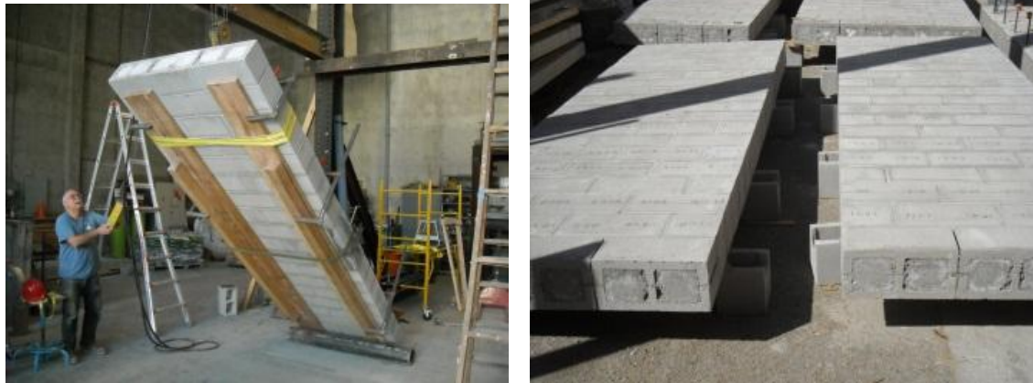
Figure 9: (a) Lowering the Wall and (b) Lowered Walls

For Walls 1, 2, and 3, there were six different heights along the wall where both the compression test and consolidating inspections were taken. The location of the specimen was identified by 3-digit grout column ID code and added another marker at the end to indicate the height along the column where that specimen came from. For compression specimens, the last markers were numbers that varied from 1-6, 1 being the closest to the bottom of the wall and 6 being the closest to the top of the wall. The compression test specimens were taken at heights of 0.3, 0.91, 1.52, 2.13, 2.74, 3.35 m (12, 36, 60, 84, 108, 132 in.) from the bottom of the wall. For the consolidation specimens, letters in alphabetical order from A-F, A starting closest to the bottom of the wall and F nearest the top were used. The consolidation specimens were taken at heights of 0.51, 1.12, 1.73, 2.34, 2.95, 3.56 m (20, 44, 68, 92, 116, 140 in.) from the bottom of the wall.