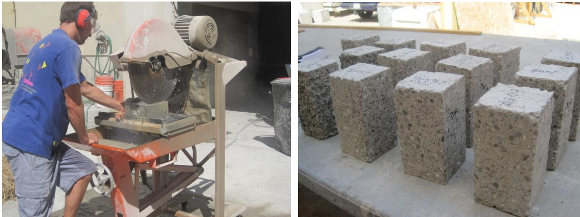
Figure 4: (a) Wet Saw Cutting Specimens and (b) Final Grout Compression Specimens

One day prior to testing, the compression test specimens were made by saw cutting the grout specimens to 102x102x203 mm (4x4x8 in.) nominal, satisfying the dimensional requirements of ASTM C1019 as shown in Figure 4.