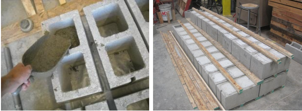
Figure 3: (a) Pouring Grout into Cores of CMUs and (b) Dry Curing Grout Specimens

One day prior to testing, the compression test specimens were made by saw cutting the grout specimens to 102x102x203 mm (4x4x8 in.) nominal, satisfying the dimensional requirements of ASTM C1019 as shown in Figure 4.