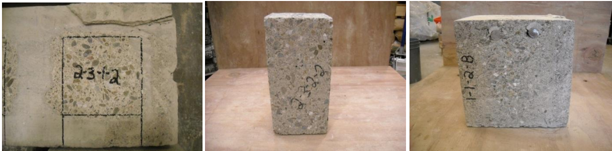
Figure 11: (a), (b), Side of Compression Specimen and (c) Consolidation Specimen

A 508 mm (20 in.) diamond blade wet saw was used to cut the compression specimens into 102x102x203 mm (4x4x8 in.) (nominal) grout units and the consolidation specimens once across the middle of the grout cell in order to see the consolidation characteristic around the reinforcement as shown in Figure 4. In total, 96 compression test specimens and 96 consolidation specimens were retrieved from the walls. Figure 11 shows wall compression and consolidation specimens.