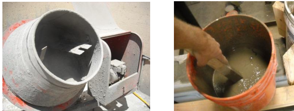
Figure 2: Grout Materials Mixing in (a) Mechanical Mixer and (b) Re-Mixing in Bucket

The material proportions were batched by volume and mixed in a mechanical mixer in accordance with ASTM C476 as seen in Figure 2.