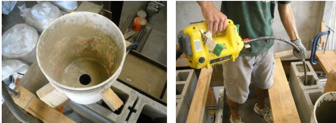
Figure 8: (a) Grout Funnel Leading into One Grout Column and (b) Mechanical Vibration

The walls were grouted between 77 and 81 days after the walls were erected. The materials were batched by volume and mixed in a mechanical mixer in accordance with ASTM C476 as shown in Figure 2. The slump test, following ASTM C1019, was conducted for the conventional grouts or a slump flow test, following ASTM C1611, was conducted for the experimental grouts. The grout was poured into the grout column through a funnel at the top. A flashlight was used to check if there was any seepage from the grout into the adjacent grout columns and none was observed in all columns. For the conventional grout columns with mechanical consolidation, the mechanical internal-type vibrator was lowered into the center and all the way to the bottom of the column before the grout was poured. Once approximately one third of the grout column was poured, the vibrator was turned on and left for 5 seconds and slowly lifted out one third of the way. This was repeated until the grout column was completely grouted and vibrated. Figure 8 shows the grouting and vibration operations.