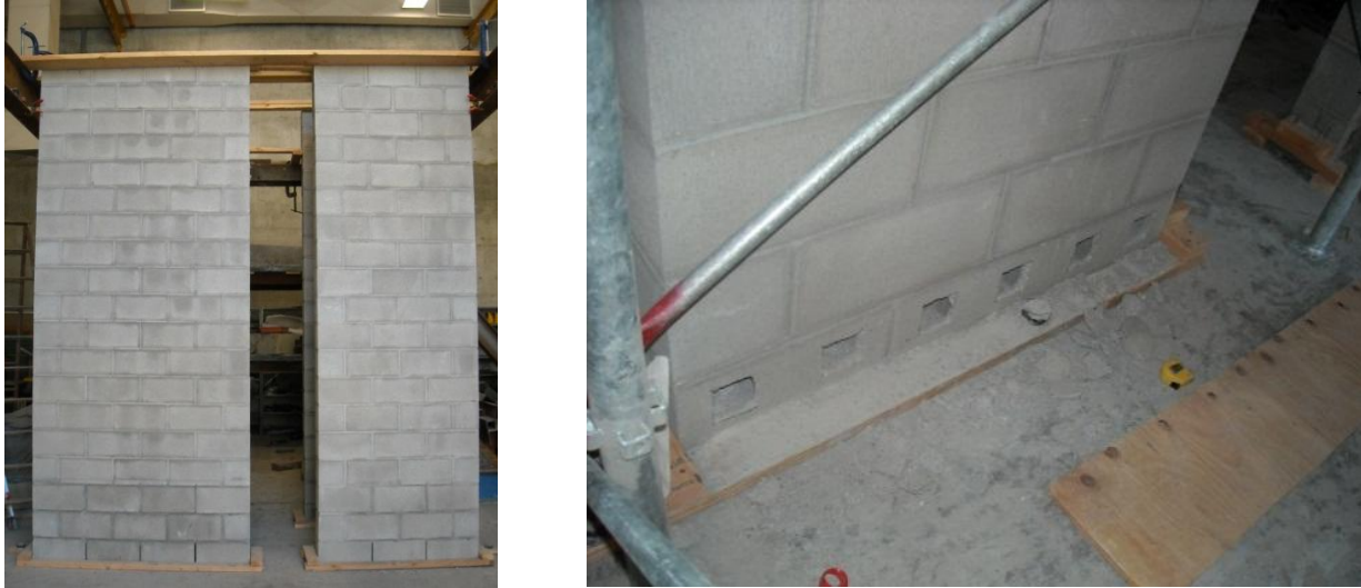
Figure 7: (a) Wall Elevation and (b) Location of Cleanouts

Cleanouts were provided in the first course of all the columns to be grouted as shown in Figure 7.