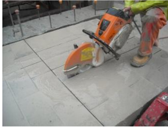
Figure 10: Cutting Wall 3 at Every Course with a 16” Diameter Diamond Blade Cut-Off Saw

A 508 mm (20 in.) diamond blade wet saw was used to cut the compression specimens into 102x102x203 mm (4x4x8 in.) (nominal) grout units and the consolidation specimens once across the middle of the grout cell in order to see the consolidation characteristic around the reinforcement as shown in Figure 4. In total, 96 compression test specimens and 96 consolidation specimens were retrieved from the walls. Figure 11 shows wall compression and consolidation specimens.