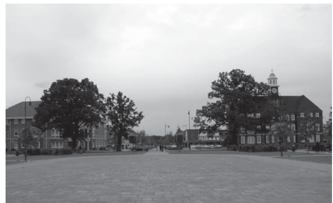
Figure 1. Letchworth's central plaza today: welcoming scenic linear axes, surrounded by civic buildings.

Garden city concept was launched when Ebenezer Howard published a detailed urban model in “Tomorrow: A Peaceful Path to Real Reform” in 1898, and soon after in “Garden Cities of Tomorrow” in 1902. His suggestion was to build satellite cities with open space and sunlight as an alternative to the existing crowded cities of the time (Rowe, 1993; Benevolo, 1960; Tafuri and Dal Co, 1976; Kaplan, 1973; Jacobs, 1961). Different from the earlier examples of a similar idea (i.e. employer housing), however, these satellite cities were imagined to be self-sufficient. It was the agricultural beltline and the factories of leading industrialists (to be moved there upon being convinced), which would provide the self-sufficiency of around 32000 residents of a garden city (Rowe, 1993, Benevolo, 1960, Hall, 2005) – although both the town and the agricultural belt were to be permanently controlled by the public authority under which the town was developed (Jacobs, 1961). Howard’s ideas, in essence, constituted a social program rather than a prescription on “how to” design self-sufficient, picturesque towns.