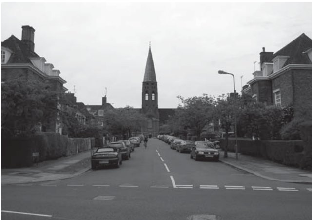
Figure 3. ...and Lutyens welcomes visitors in Unwin's Hampstead Garden Suburb.

The high standard of architecture and firm design-control policy exercised through the Trust were notable characteristics of the Hampstead Garden Suburb. The Suburb was praised for its achievement of the English domestic revival in its eclectic visual expression (Miller, 1992). It was also seen as a viable solution for extending big cities by the proponents of the city beautiful tradition (Jackson, 1985). However, the emphasis on design and the high quality of architecture obscured Henrietta Barnett's social purpose and subverted her original intentions (Miller, 1992; Jackson, 1985). Unwin's intention of creating aesthetic quality in housing was so exaggerated that it became an obstacle in creating housing for all (Jackson, 1985). By 1936, it was admitted that Hampstead Garden Suburb could not meet its original social objectives (Miller, 1992). Hampstead Garden Suburb also failed to fulfill the expectations of the Garden City movement and served as a model for the easier suburban option (Miller, 1992).