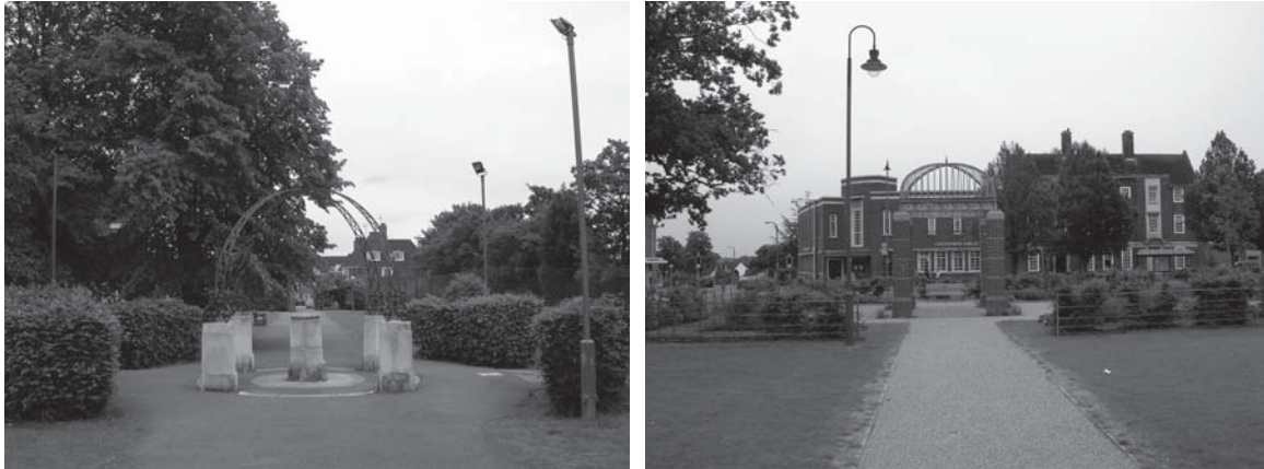
Figure 5. Two faces many are familiar with from New Urbanist settlements: left, a gazebo from Hampstead Garden Suburb, right, a gazebo from Letchworth.

Shortly before the Second World War, in order to overcome the housing shortage, public authorities began to provide housing on any available site, which could be acquired without worrying about the problems of slum clearance and redevelopment of the central areas (Rowe, 1993). The most influential policy was the generation of new towns, which were mostly directly provided by the central government in the beginning and by the local authorities in the following applications, as satellite cities in order to decentralize the industry (Benevolo, 1960). Nevertheless, the production level of housing significantly decreased quickly due to the war. The number of houses and flats built in 1938 was 350,000, while it became 7,000 in 1944, right before the end of the Second World War (Russell, 1981). Initially the idea was generated as an emergency measure before the Second World War for London due to the high concentration of industry. However, after the Town Planning Act of 1947, new towns became the norm in the whole country under ordinary circumstances. By 1954 about half the population anticipated for the seven new towns around London had been settled into them (Benevolo, 1960). New towns turned out to be large and fully equipped suburbs (Tafari and Del Co, 1976).