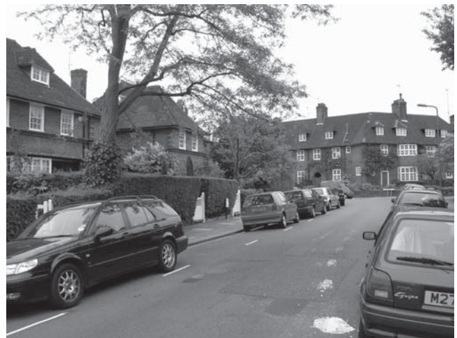
Figure 2. Unwin's eclectic physical expression in houses on an organic layout in Hampstead Garden Suburb (Photo: U. Toker).

The Garden City Association took interest in her proposal, since she referred to the proposed housing development as a garden suburb, probably to exploit the publicity of the first garden city, Letchworth. In May 1904, Henrietta Barnett brought eight relatively "important" people together as a Steering Trust to work in coordination with the Heath Extension Council (Miller, 1992). The Barnetts had mistrust for local authority housing and found it "too easy and too cheap a remedy" (Jackson, 1985: 83). Also, the local authority showed no interest in this proposal (Miller, 1992). Unwin was hired to materialize Henrietta Barnett's dreams (Miller, 1992). Although Raymond Unwin strongly criticized suburbs (Hall, 2005) and had his own dreams, these obviously were not at odds with Henrietta Barnett's – at least in appearance. In essence, Hampstead Garden Suburb was a compromise of the Garden City ideals and an endorsement of suburban sprawl. However, Unwin, realizing the visual potential of the Heath and cottages of various sizes, chose to focus on the aspects of the scheme which were parallel to the Garden City ideals (Miller, 1992). Rather than the Garden City ideals, however, Henrietta Barnett was interested in replacing the slums with village living where all classes live in harmony and in abundance of space and beauty (Jackson, 1985).