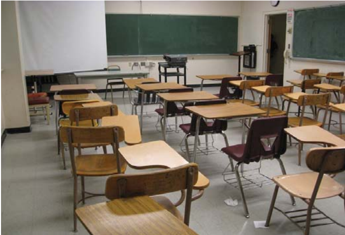
Figure 2: Typical smart room used for element design courses