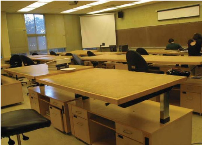
Figure 3: Typical smart room used for laboratory design courses