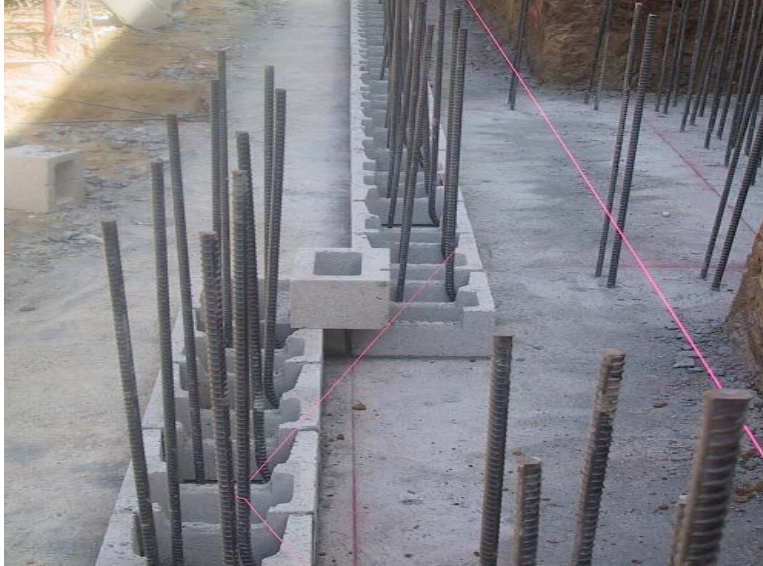
Figure 6: CMU Reinforcement Placement