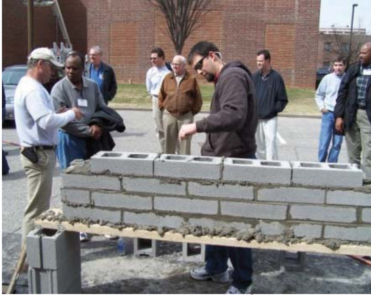
Figure 4: Construction of masonry wall 1