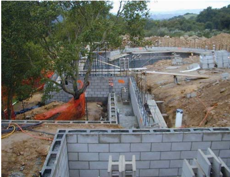
Figure 7: CMU wall showing grouting