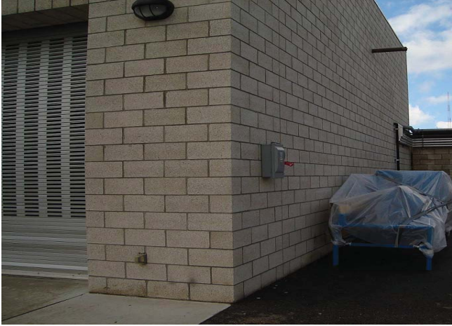
Figure 1: CMU wall elevation