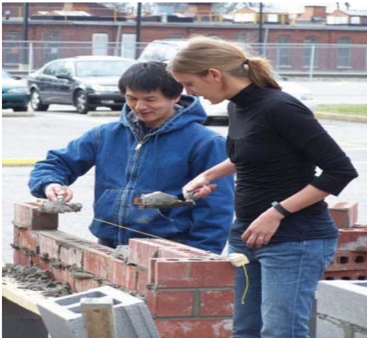
Figure 5: Construction of brick wall 1